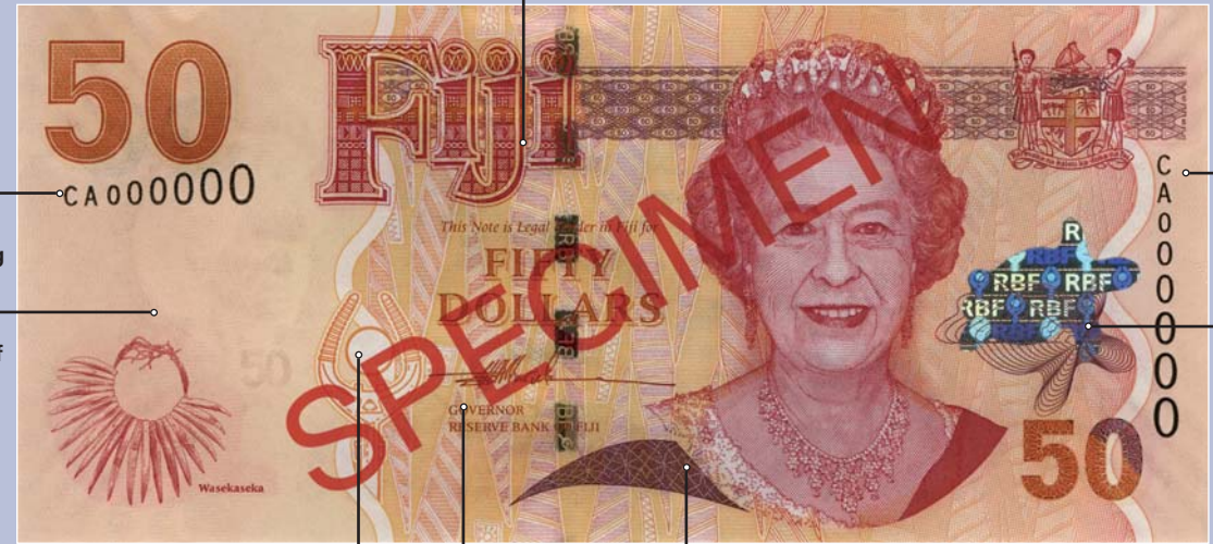
$50 Orange (151 x 67mm)