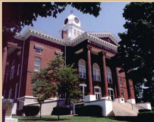
Lincoln County Courthouse

The city of Stanford has made great strides in preserving its heritage. Many restoration projects have been completed in the past few years and several more are scheduled in the near future. The central historic area was named to the National Register of Historical Sites in 1993 and Stanford was designated a Preserve America community by First Lady Laura Bush in 2004.