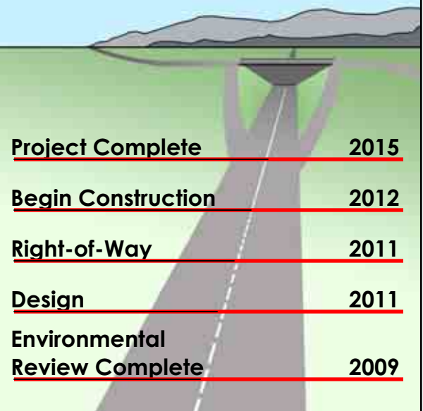
Estimated schedule - subject to revision