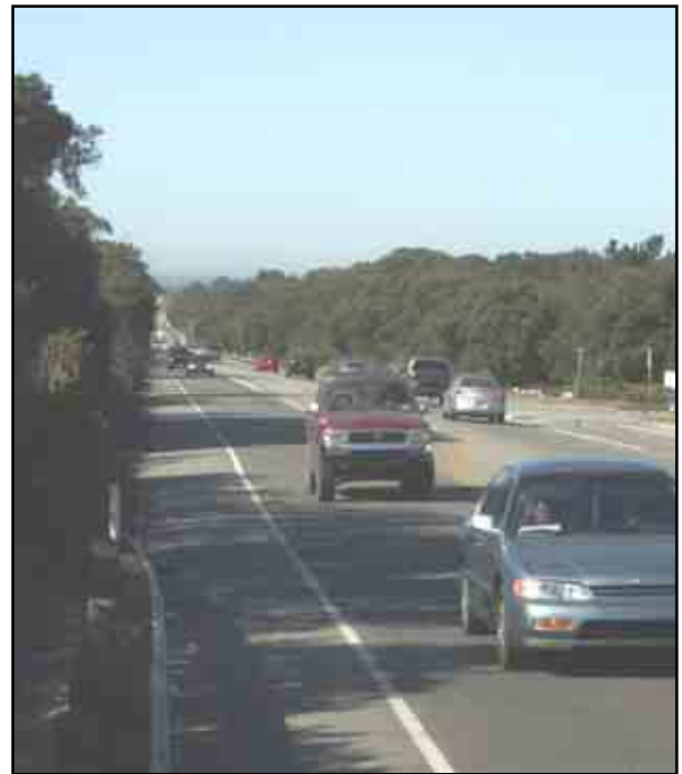
Looking westbound on SR 156