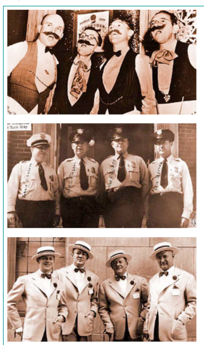
Figure 1. Three Early Championship Quartets: The Barflies (1939), the Flat Foot Four (1940), and the Elastic Four (1942)

survivor and all singers from nine of the 25 quartets studied are deceased. Consequently, it is important and vital to the music community to annotate the historical significance of these men's accomplishments and their impact upon the barbershop style.