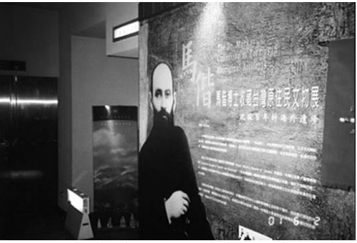
Image 5- Panel at the entrance to the exhibition. This contains Mackay's image, a brief description of the exhibition, and the names and logos of its organizers and sponsors. An Air Canada advertisement is visible to the left in the background.