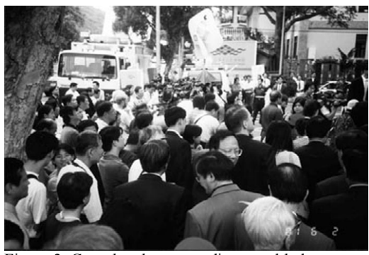
Figure 3: Crowd and mass media assembled to watch ribbon cutting ceremony. In the background are two news trucks (Formosa TV and Public Television Service) with their satellite dishes pointed skyward. TVBS also had a satellite news truck there.