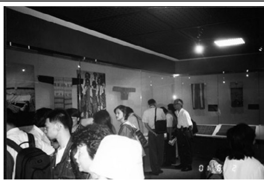
Figure 6- Inside the exhibition. Some of those in attendance view displays of woven garments. There are also pictures of Aborigines from the late 1800s in the displays.