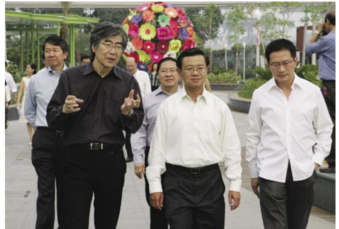
at VivoCity, such as the courtyard, the roof-top plaza, and its 300m boardwalk.

The artworks include a 6m spherical bouquet of colourful flowers, a 10m tall rocket, a gigantic skinny snowman, an enormous snowflake, a series of massive rose blooms, an engaging sculpture of a man on horizontal bars, as well as a series of colourful man-like figures in various poses (below). These larger-than-life pieces adorn various outdoor spaces