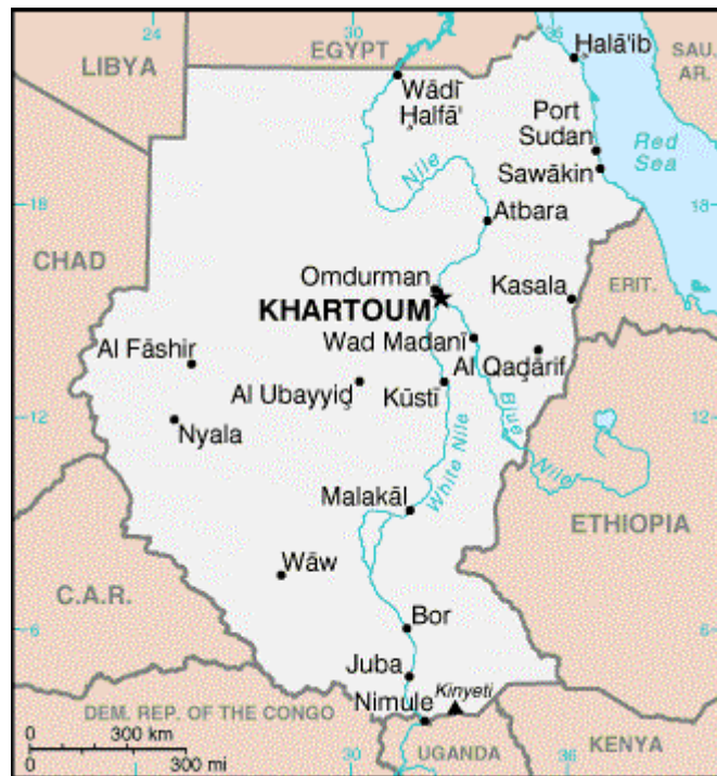
Figure 3. Sudan

In early 1998, bin Ladin and those involved with Islamic extremism in East Africa committed themselves to a string of operations designed to show the world their commitment to jihad and their wide span of operations. 216 Bin Ladin's alliance warned the