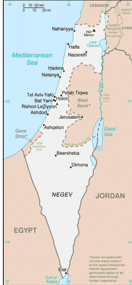
Figure 5. Israel