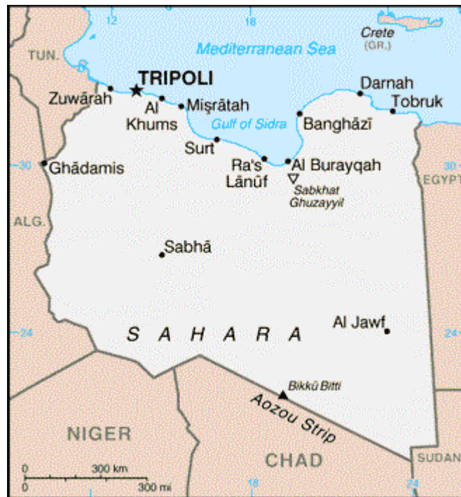
Figure 1. Libya

In 1981, Qadhafi had been the Libyan leader for twelve years. 58 For years, Qadhafi had been spending Libya’s oil and gas earnings building a robust military. 59 Further, according to Caspar Weinberger, “Qaddafi had long maintained claims, insupportable under international law, that he controlled the entire Gulf of Sidra, the great body of