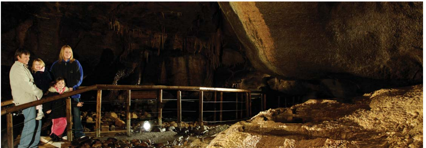
The 'paddy fields': one of the best examples of rimstone pools in the caves

The tour lasts for approximately 75 minutes and involves a walk of approximately 1.5km. Each tour party is conducted through the caves by one of our lively and informative local guides ensuring that your enjoyment and ultimately your safety are paramount.