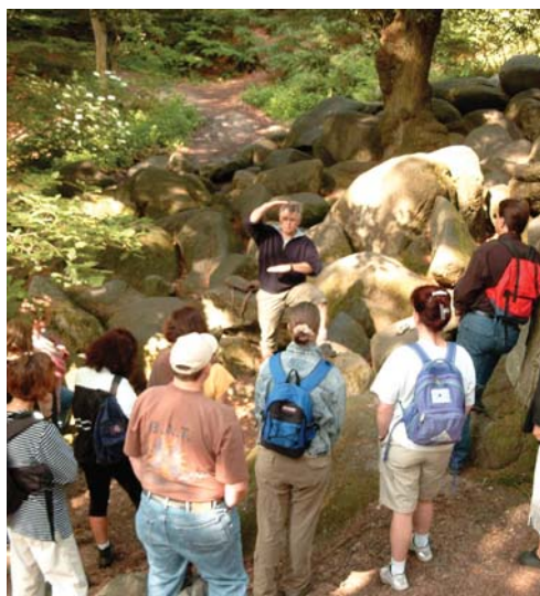
Felsenmeer or 'sea of rocks', one of the many fascinating landscapes of Bergstrasse-Odenwald Naturpark

Whilst at Bergstrasse-Odenwald Naturpark, also in Germany, water-action from many millions of years ago led to the formation of the Messel Pit UNESCO World Heritage Site. This ancient freshwater lake has preserved many creatures in near perfect conditions including horses, turtles, crocodiles and bats. The Geopark has many other attractions on offer which can be explored with the help of the superb Geopark Wardens.