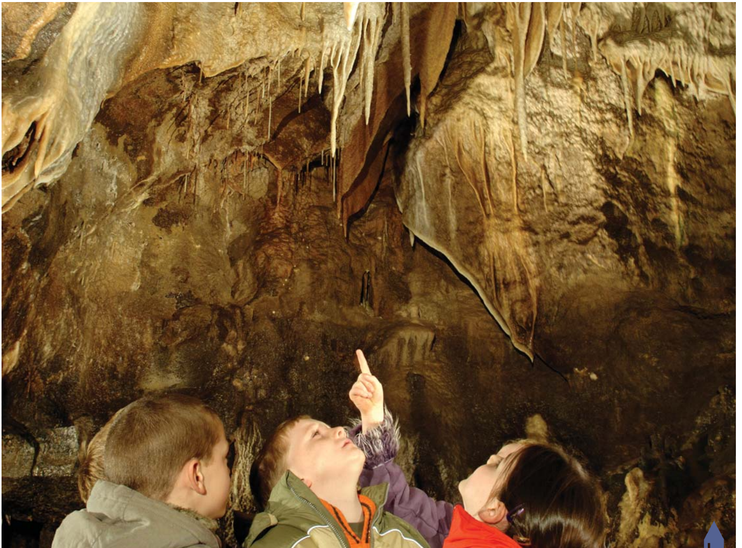
Creamy stalactites and cave curtains line the cave roof at various points during the cave tour

Once inside the caves, the path continues to the jetty where you will embark upon a short boat journey taking you along the Cladagh River and further into the Marble Arch Caves system. Part of the tour follows the journey of Edouard Martel, a daring French cave scientist who first explored the caves in 1895.