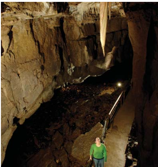
The longest stalactite in the caves is named after the man who first explored the Marble Arch Caves, Edouard Martel