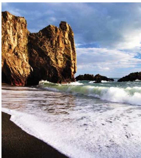
The spectacular cliffs of the Copper Coast European Geopark