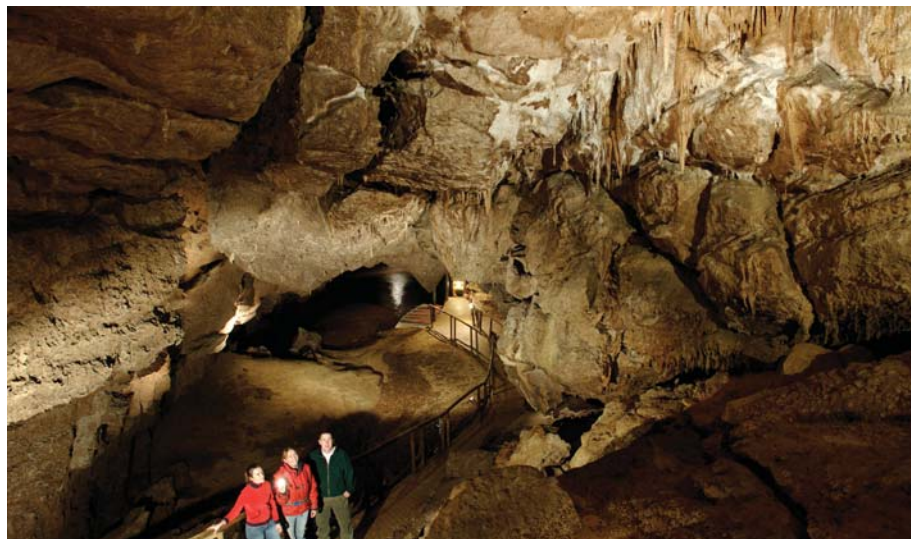
Underground rivers have helped to carve the Marble Arch Caves over many thousands of years.