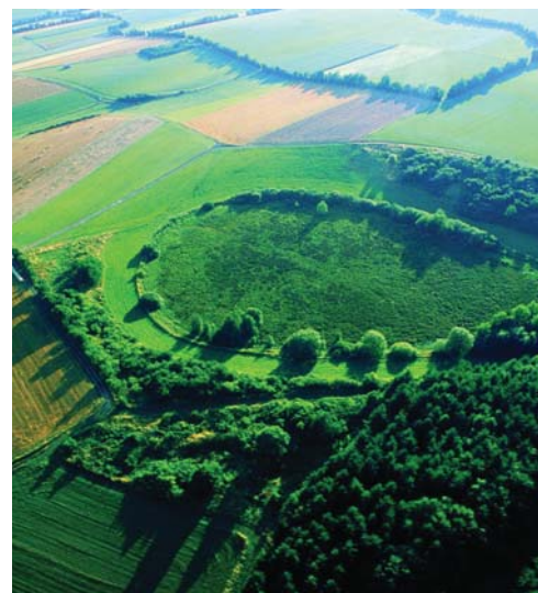
The 'eyes of the Eifel'; one of the many ancient volcanic craters of Vulkaneifel European Geopark