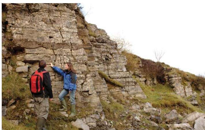
University students investigating a disused quarry

Contact Marble Arch Caves European Geopark for information about the Geography / Geology and specific areas to visit. A pack of information with a map, work sheets for photocopying is available for University Lecturers. Universities are asked to contact staff at Marble Arch Caves European Geopark in advance of a field visit to any of the European Geopark sites, so that a member of staff can accompany you during your visit.