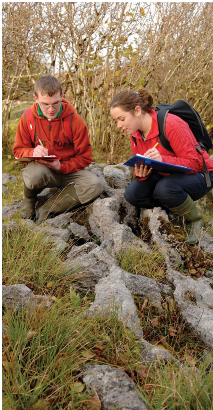
Studying the limestone pavement on the limestone trail