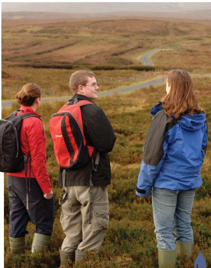
Walkers on the Legnabrocky Track

Marble Arch Caves European Geopark is a remote and exposed location, with weather conditions often changing rapidly. None of these walks should be attempted without good boots, warm and waterproof clothes and some emergency food and gear.