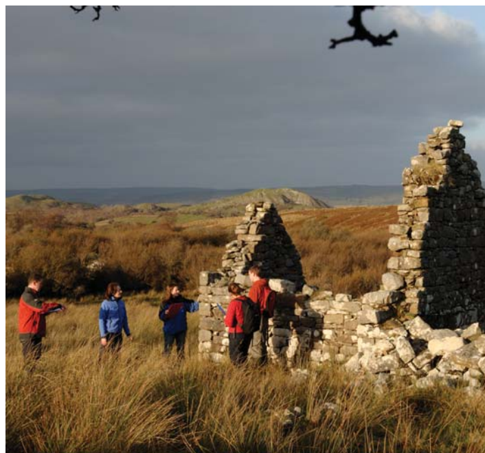
One of the many 19th Century derelict farm cottages

Approximately 1 mile away from the Marble Arch Caves Visitor Centre is Killykeeghan Nature Reserve. This pleasant circular route takes you past many archaeological as well as geological features of the landscape. There are car parking and toilet facilities at the site.