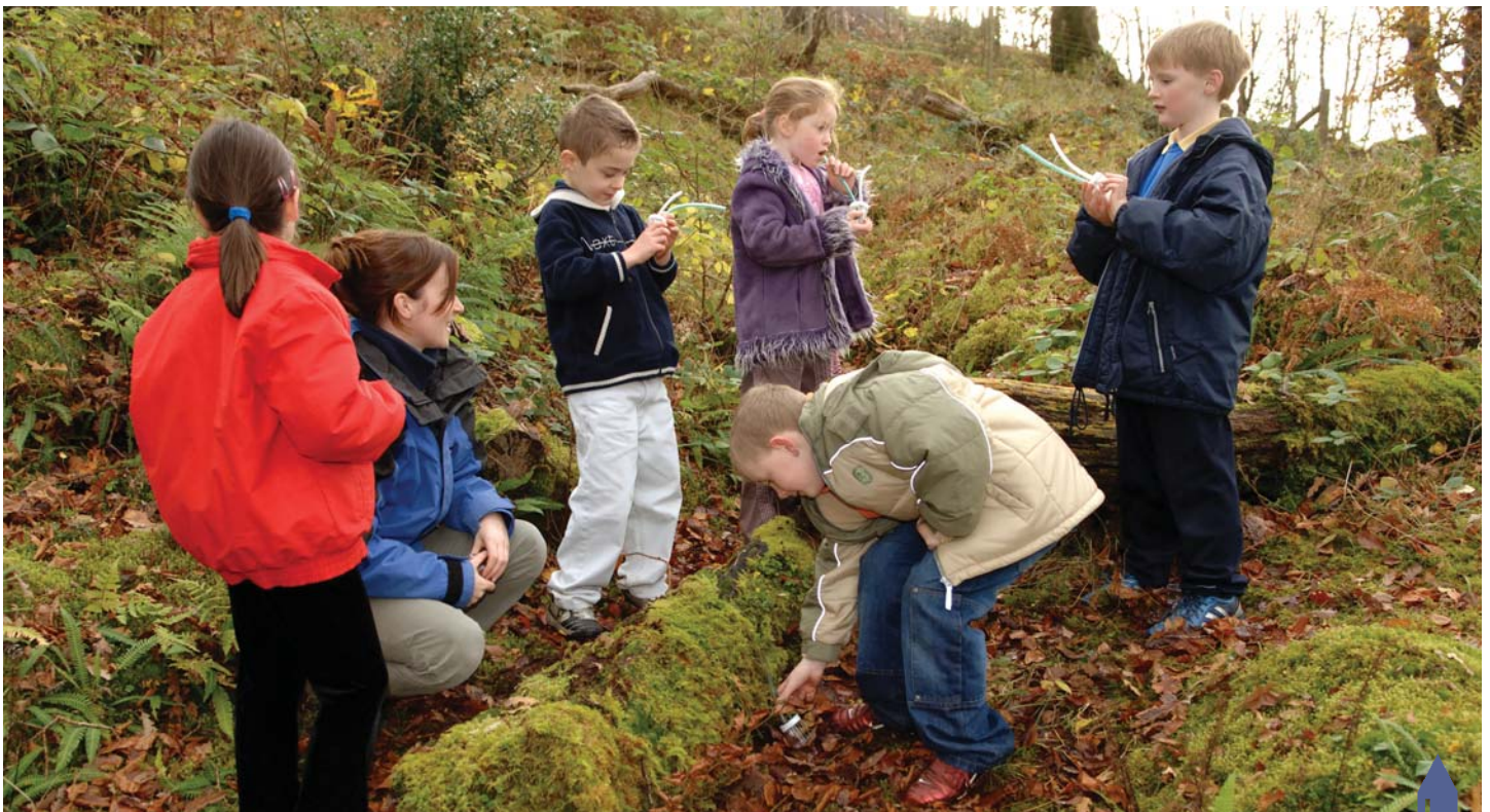
Woodland Wardens at work in the Cladagh Glen

Theme B: Physical Processes and Challenges, 3, Distinctive limestone landscapes must be managed to avoid long-term damage, along with Theme C, Ecosystems and Sustainability. A trail that includes the role of rock, structure and weathering process in creating this distinctive environment, limestone features and human pressure on the limestone and the peatland. This fieldwork assists in delivering the themes Learning for Life and Work Area: Local & Global Citizenship Strand and Environment & Society Learning Area: Geography Strand through map-work, role-play, planning, drawing and presenting.