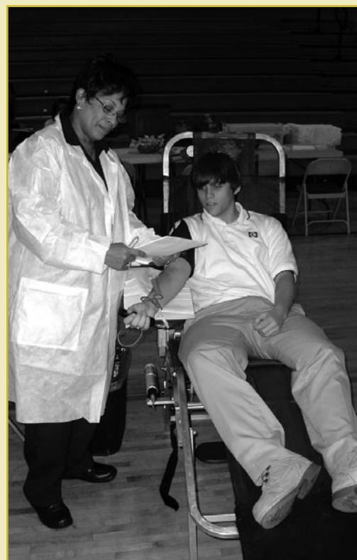
The SAC recently sponsored a successful blood drive where they collected 39 pints.