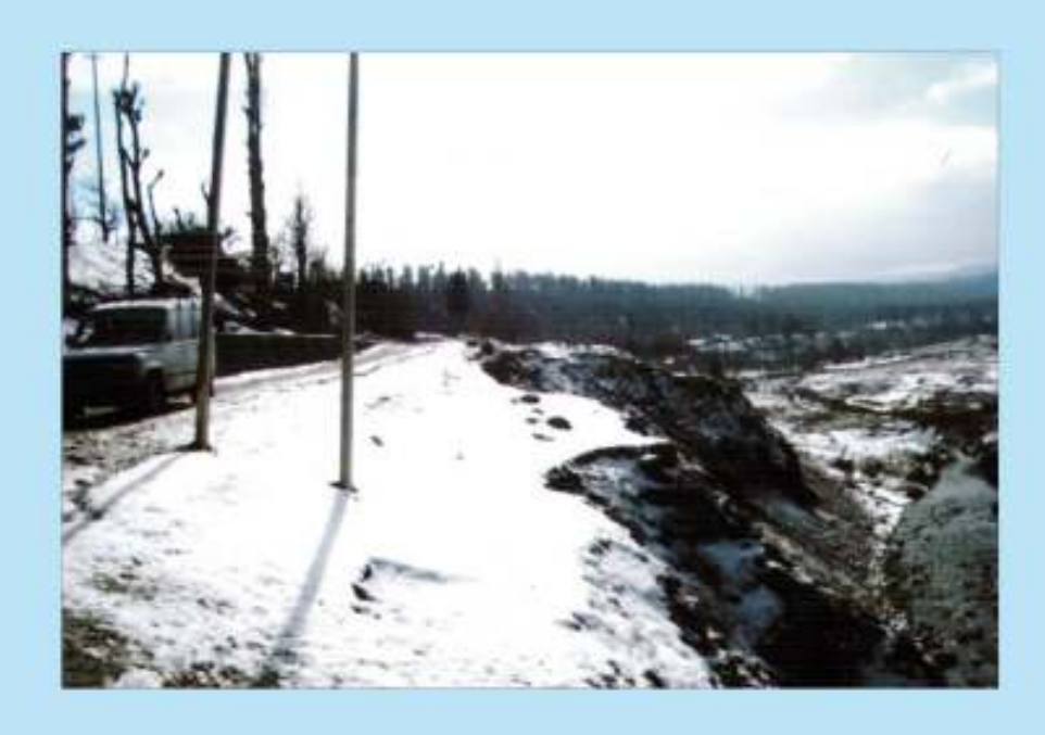
VIEW OF TOWN SHOPIAN