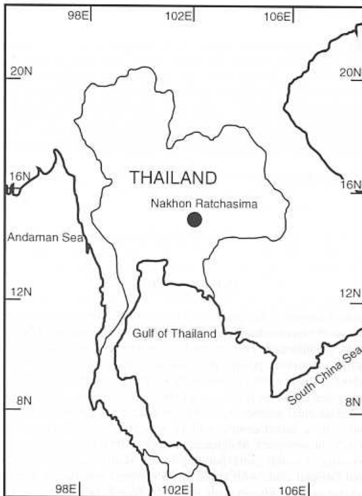
Fig. 1. The map of Thailand showing the sampling locality of Crocidura hilliana (OCUMS 3279) examined in this study.

data for 15 Oriental species agree well with this hypothesis (Ruedi & Vogel, 1995; Motokawa et al., 1997; Fang et al., 1997). The only exceptional case to this trend is the karyotype recorded from Thailand ( 2n = 50 , FN = 66 ) by Tsuchiya et al. (1979). This karyotype was reported as of " C. attenuata ", but the identification of this specimen is probably erroneous (Motokawa et al., 1997). Therefore, the karyological data for Thai specimens with accurate morphological identification are desired to test the hypothesis proposed by Maddalena & Ruedi (1994). According to Hutterer (1993), known species of this genus from Thailand are C. fuliginosa (Blyth, 1855), C. attenuata Milne-Edwards, 1872, C. pullata Miller, 1911, C. monticola Peters, 1870 and C. horsfieldii (Tomes, 1856), in the order of decreasing body sizes. Recently, Jenkins & Smith (1995) described C. hilliana as a new species, in which cranial size is intermediate between and overlapping with C. fuliginosa and C. attenuata , from Loei Province, northeastern Thailand. Of these six Thai species, three have been karyotyped, C. fuliginosa for Malayan sample (Ruedi et al., 1990; Ruedi & Vogel, 1995), C. attenuata for Taiwanese sample (Motokawa et al., 1997; Fang et al., 1997), and C. horsfieldii for Indian sample (Krishna Rao & Aswathanarayana, 1978), but the remaining three have not been karyologically studied.