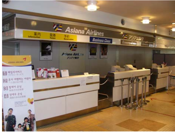
Counter of Asiana Airline

Departure Check-in Counters are located on the first floor.