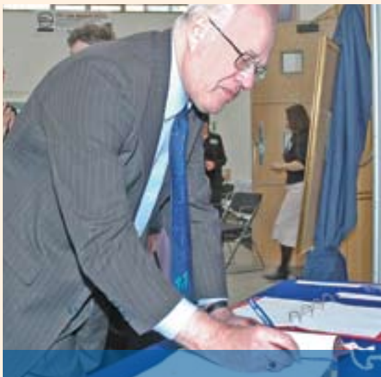
University Chancellor, Lord Carey of Clifton