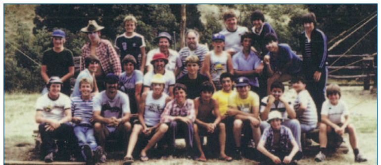
The first camp - styled after M.A.S.H.