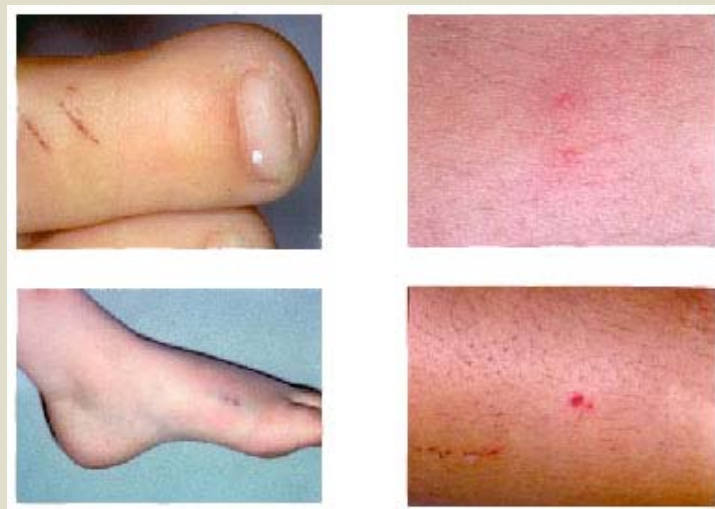
Figure 5. Appearances of Australian snake bite. Top left a 'classic' Common Brown Snake bite with two fang marks about 1 cm apart and little associated trauma or reaction (photo J Tibballs); Top right scratch marks associated with unknown species (photo SK Sutherland); Bottom left bite from unknown Queensland species (photo Prof J Pearn); Bottom right bite from mainland Tiger Snake (photo J Tibballs).