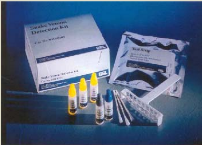
Figure 6 The CSL Ltd snake Venom Detection Kit

Although all could be treated with Black Snake antivenom, only the first three should be treated with Black Snake antivenom (if clinically indicated) because the last three are adequately treated with Tiger Snake antivenom which is of smaller volume and less expensive. The rates of false positive and false negative results of the kit are not known but are generally regarded as low.