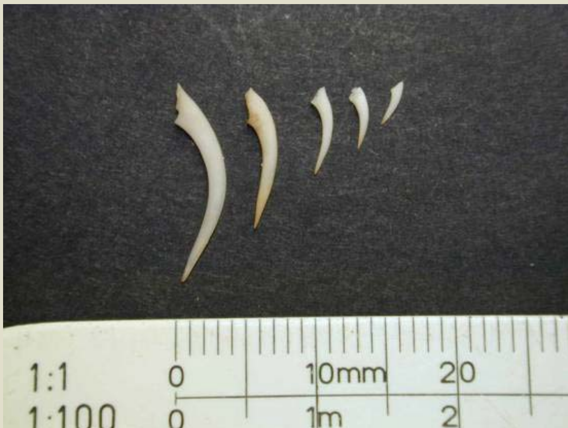
Figure 2 Comparative sizes of snake fangs (from left to right) – Bitis nasicornis (Rhinoceros Viper, exotic), Taipan, Death Adder, Mainland Tiger Snake, Common Brown Snake

Snakes may bite but fail to inject venom. Only 20% of patients presenting with 'snake bite' develop clinical envenomation and even when a bite is confirmed envenomation develops in less than 50%.