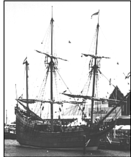
The Batavia replica at ANMM

Two men, thought to have had a homosexual relationship, were cast ashore with provisions on the mainland. They qualify as Australia's first European residents, but were never heard from again. Sydney Mardi Gras participants might make a note of this for an imaginative Batavia float.