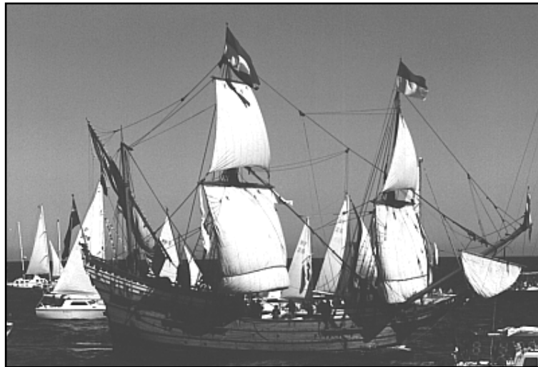
Duyfken Departing Freo on 8 April