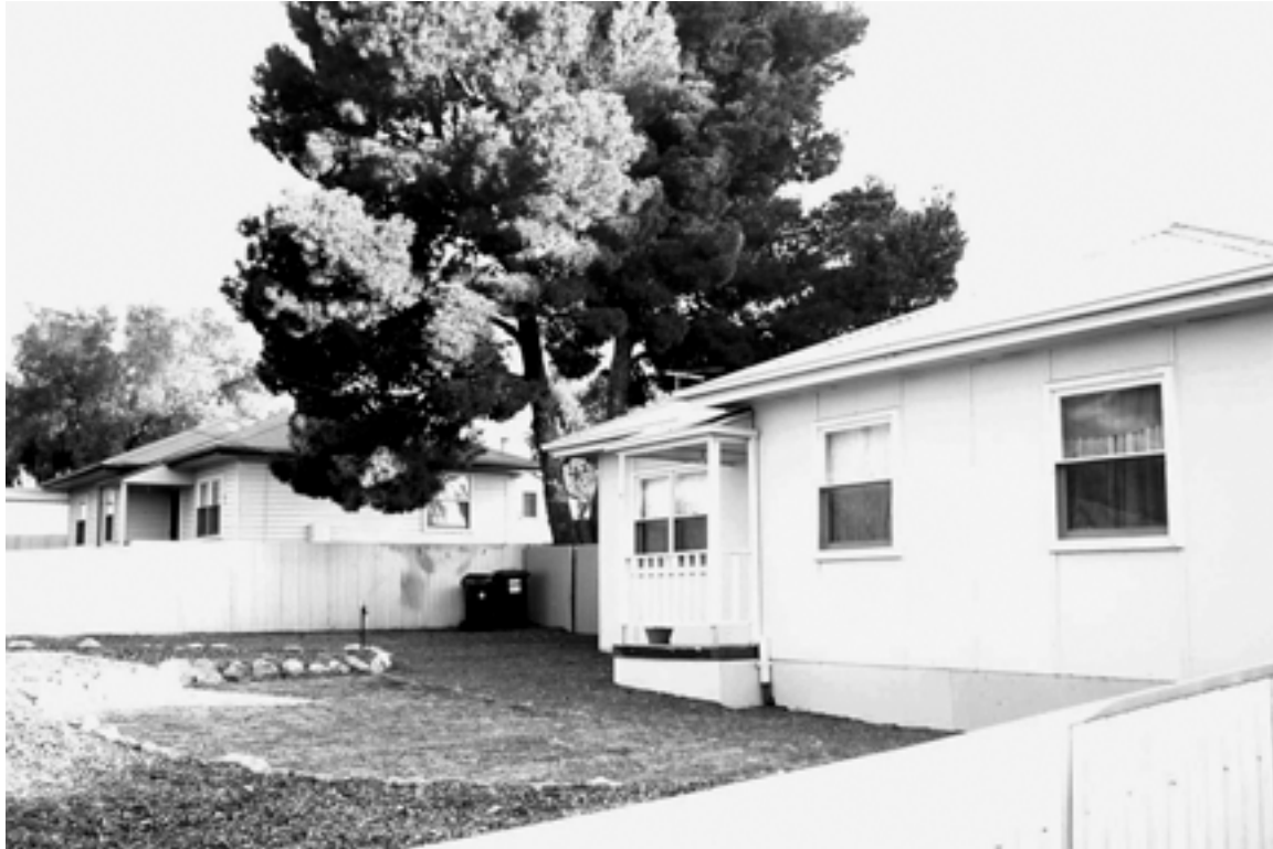
Fibro houses at Kapunda

The South Australian Housing Trust avoided parts of Adelaide where development costs were too high (for example on hilly ground) or were choice areas for private subdivision. Mitcham displays these social differences. Flat areas were built over by public housing authorities but on the district's beautiful rising ground most subdivisions and house sales were by companies or individuals. Adelaide Co-op Building Society subdivided 'Nunyara' at Belair in 1947. In 1949 nineteen acres were subdivided at Netherby – and the largest mulberry tree in South Australia was removed. 173 The entire Hills face came under subdivision pressure – at Belair, Blackwood and Eden Hills and within Burnside Council, where Stonyfell's Magill vineyard was subdivided in 1955–58. 174 Hills face quarries also proceeded at full blast, and the visible impact of housing and construction reinforced calls for town planning controls, which Playford resisted.