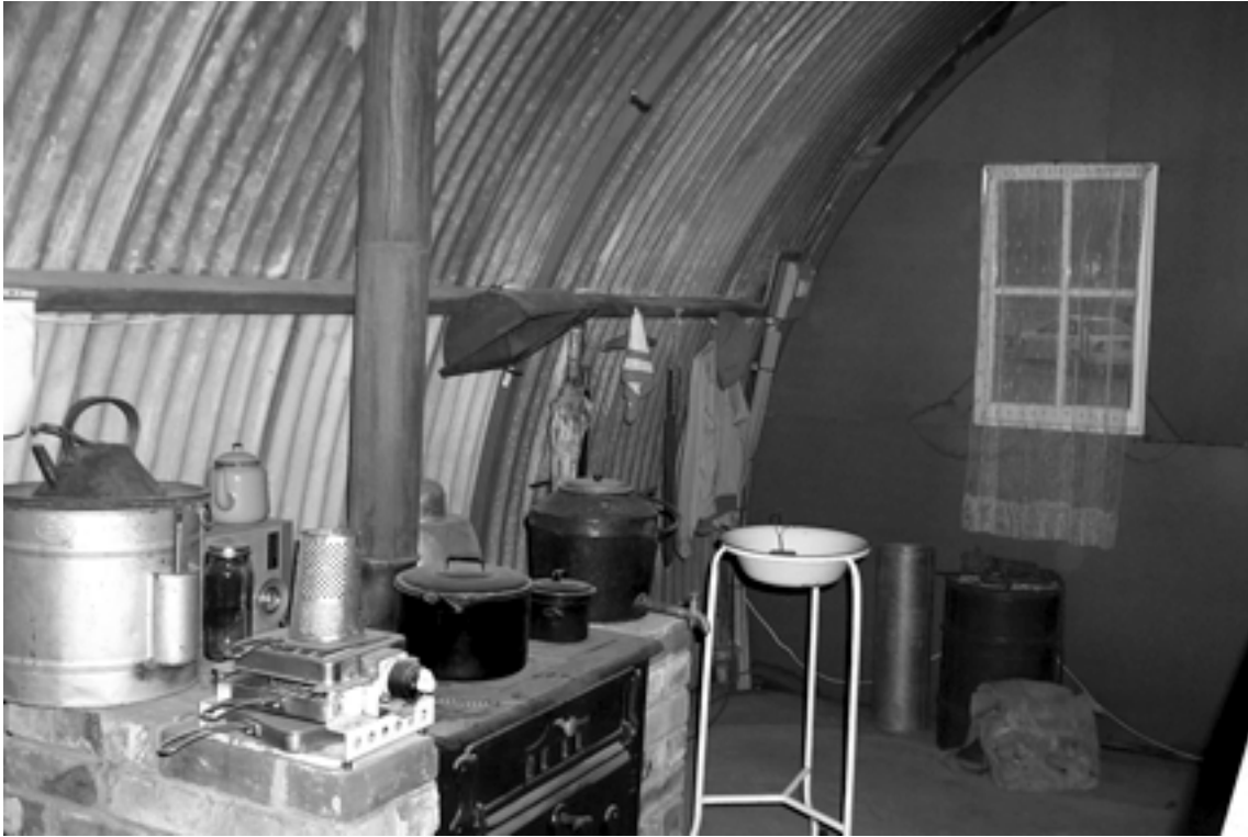
War Service Land Settlement Nissen hut, now at Loxton Pioneer Village.

Linked with rising capital investment were efforts to improve soils and diversify production following the ruinous droughts and erosion of the 1940s. Farmers developed 'a productive drylands system integrating cereal crops and stock'. 77 Mixed farming replaced single cropping and pastures were sown in rotation with legumes to build up soil nitrogen. Sheep and cattle numbers rose dramatically, helped also by high prices (during the Korean War). 'These changes in land use were accompanied by an expansion of the cropped land area beyond the previous scale of the 1920s, and an increase of the pastoral leases almost back to the previous peak of the 1880s.' 78