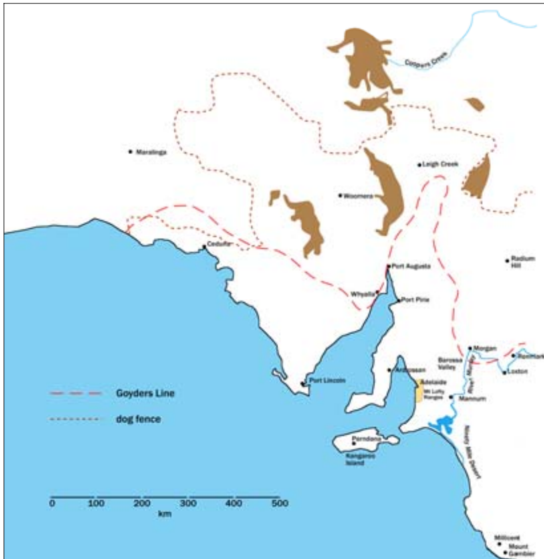
South Australia showing the locations of places referred to, as well as Goyder's Line and the dog fence.