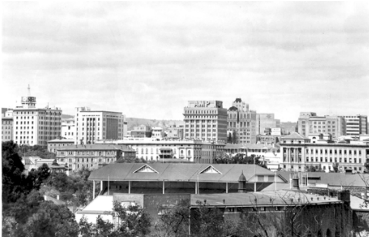
Adelaide circa 1960 (S Marsden collection)

development, public housing and transportation'. 194 Local government had little power to regulate the location of industry or even the calibre of public housing, as broad state interests over-rode those of local residents. It also means that many of the suburbs built between 1945 and the introduction of planning in 1962 demonstrate not only an 'austerity' style but also a mix of domestic, commercial and industrial landuses.