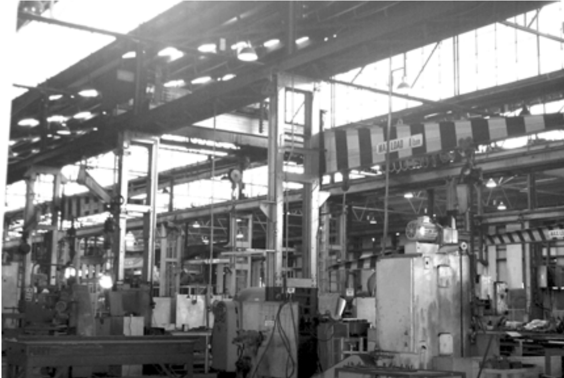
Perry Engineering Works (interior), Railway Terrace, Mile End

In 1946, after offering generous inducements, Playford announced that Philips Electrical Industries would transfer from Sydney to Hendon. Philips bought the entire ammunition factory, eventually covering 64 acres, and it was opened in 1947. By 1957, at the peak of production, there were nearly 3,500 workers, many of them female at a time when there was little other factory work available for women. 91