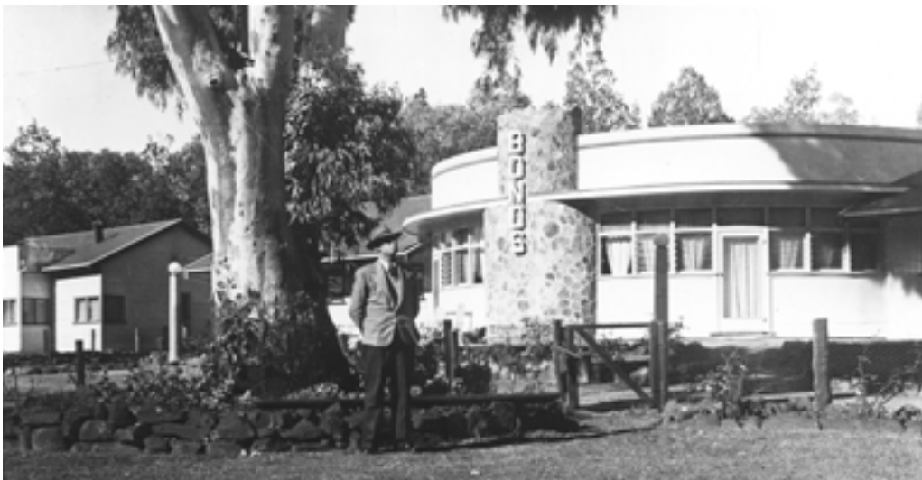
Wilpena Pound motel

The Blueline opened at West Beach in 1954 as the state's first drive-in theatre. The Marion Metro Twin drive-in opened in 1957 and Port Elliot drive-in opened in 1958. Eventually, more than 14 were built in the suburbs and 10 in country towns but only three (Gepps Cross, Barmera and Murray Bridge) still operate, and only one (Gepps Cross) in Adelaide. The rise of tourism, especially to outback South Australia and the spectacular Flinders Ranges, depended on private car use. Purpose-built motels were modelled on American motels (motor hotels) first provided along Route 66 in the 1930s. Australia's first motel is said to have opened in Tasmania in 1949 but the South Australian Tourist Bureau established a resort near Wilpena Pound in 1945 with a 'chalet-style' motel. Perhaps because it has remained under government control, the Wilpena Pound Motel retains its original design. 134 This fantastic mix of Swiss chalet and American motel set in an Australian wilderness illustrates Davidson and Spearritt's observation that tourism history 'throws into relief, by virtue of its hyper-real quality, certain assumptions of a given period, perhaps more clearly than most social activities'. 135