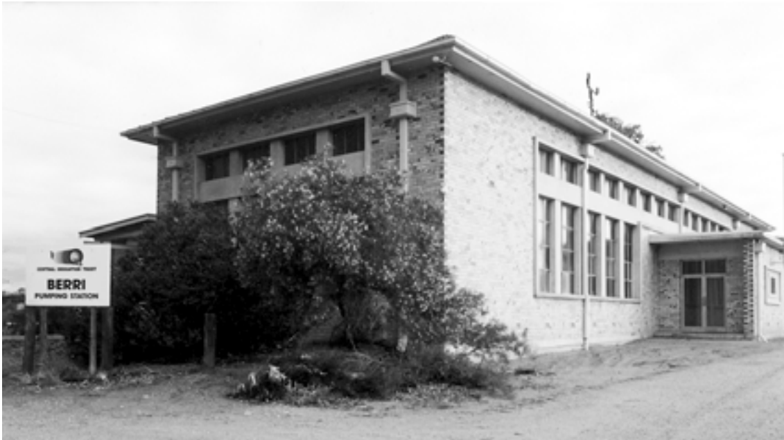
Berri pumping station

Government was also responsible for the most extraordinary single structure built for primary producers: the Dog Fence (1946–47). 75 It is one of Australia's three great fences (the others are rabbit-proof fences in WA and Queensland). The Dog Fence linked a series of disconnected vermin fences in South Australia, NSW and Queensland, spanning 5,400 kilometres, with 2,200 km in South Australia. It protects southern sheep country from dingoes, and grazing land north of the fence is given over to cattle which can defend themselves from attack. Constant patrols were (and are) needed to maintain the fence and were done on camel until the early 1960s. 76