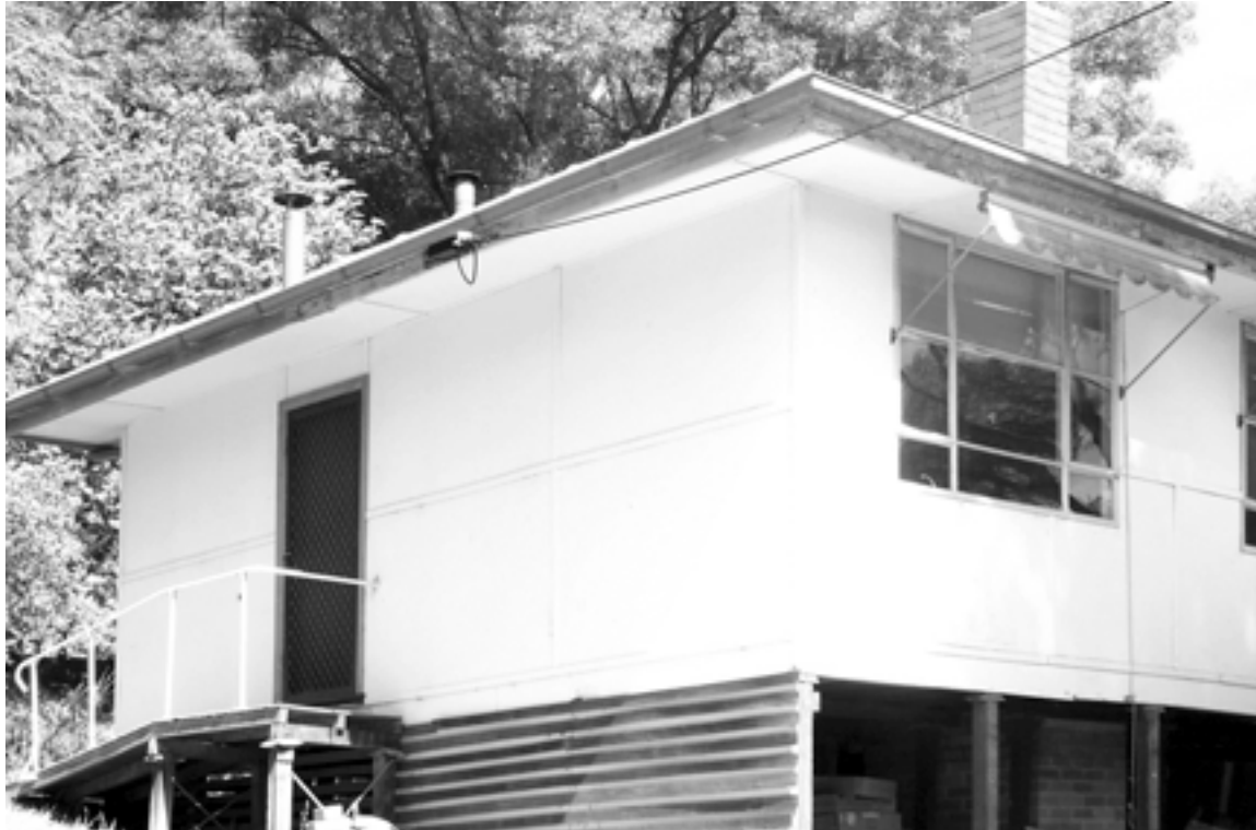
Fibro house at Blackwood

Frank and Teresa McDonnell rented and later bought one of a group erected by the German contractor Wender and Duerholt on Morphett Road, Dover Gardens. The house stood on blocks and had Baltic pine walls, five small rooms and two power points. 'They came out in kit form – they were austere, there was no tiling, no outside lights ... But we were very lucky to get one, to get accommodation was almost impossible ... to people back then this was a castle.' They raised six children in 'Rose Cottage', gradually transforming it. A plaque is placed there to honour its German building workers. 171 Prefabricated houses were also imported privately: Swiss settler Max Schleuniger imported one from Switzerland to replicate his homeland's architecture in Adelaide, completing the effect with a fir tree planted in the front garden. 172