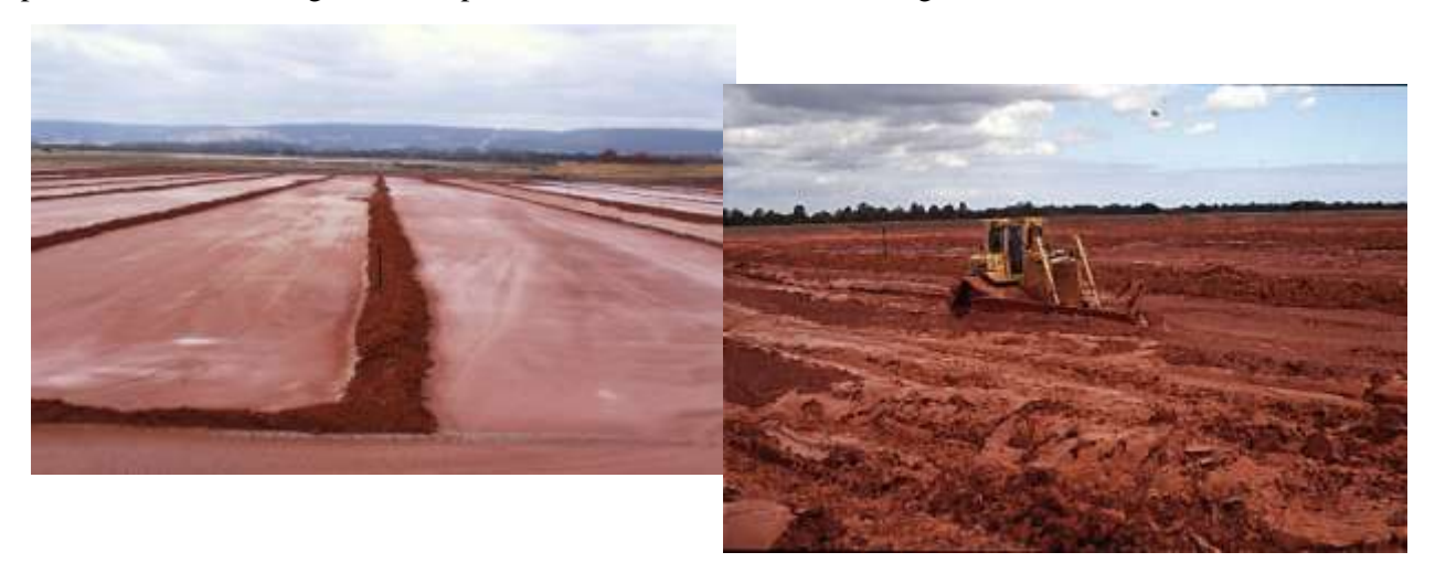
Figure 3 Spreading the slurry, and ploughing using a D6 Swamp Dozer to enhance the drying rate

Mud farming also minimises the potential for dust generation, which is important given the location of the refineries close to residential areas. Ploughing the surface presents a wet surface, buries carbonate, and provides a surface roughness that prevents dust lift-off once the tailings have dried.