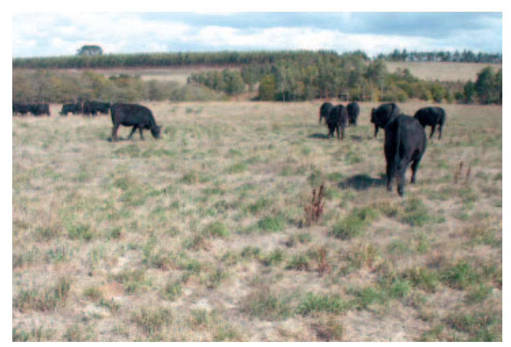
Above: The long-term aim at 'Moffitts' is to integrate trees into the landscape.

Opposite page: Farm forestry blocks (left) are staggered across 'Moffitts' and are connected by corridors. High pruning logs (right) increases their sale value.