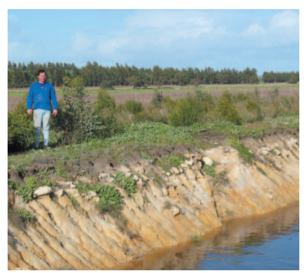
Above: Deep drains have relieved the impact of rising water tables but introduced soil mangement challenges.

Opposite: Lucerne is the main tool for profitably managing salinity.