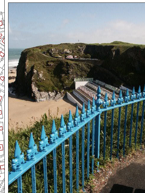
Tolcarne promenade offers the potential for a high quality public open area linking with the beach below