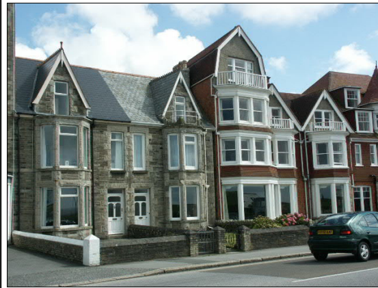
Surviving reminder of the former private villa development of the early 20 th century