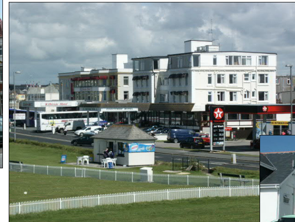
Enhance property fore-courts