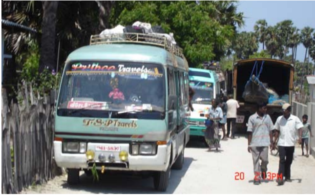
The first convoy leaves

The first convoy started to move. The SLN at the check point of the entrance of the village stopped them. We were still organizing the rest of the buses and lorries. As soon as we received the message that they were stopped, we rushed to the spot. We spoke to the SLN commander at the point and negotiated them to allow the people go without any harassment. They got down all