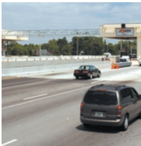
Conversion to express tolling nearly complete.

This diagram to the right shows how traffic will flow through the remodeled plaza. ◀