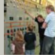
WHAKAMARU CELEBRATES HALF CENTURY