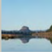
WAIKATO RIVERCARE NATIVE PLANTING PROJECT