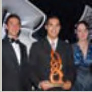
JUNIOR MAORI SPORTS AWARD WINNER ANNOUNCED