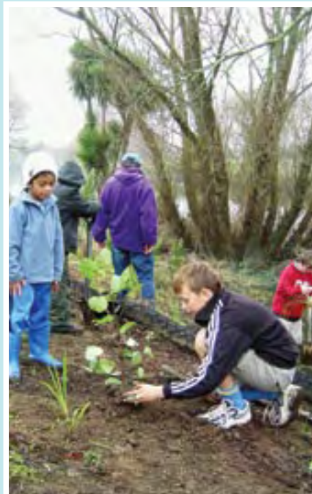
Pupils from Glen Massey School plant saplings on the bank of the Waikato River as part of the Rivercare initiative near Taupiri.

Waikato RiverCare was established in 1999 with a vision to implement a sustainable programme to plant native vegetation on the banks of the lower Waikato River. Taupiri is one of eleven