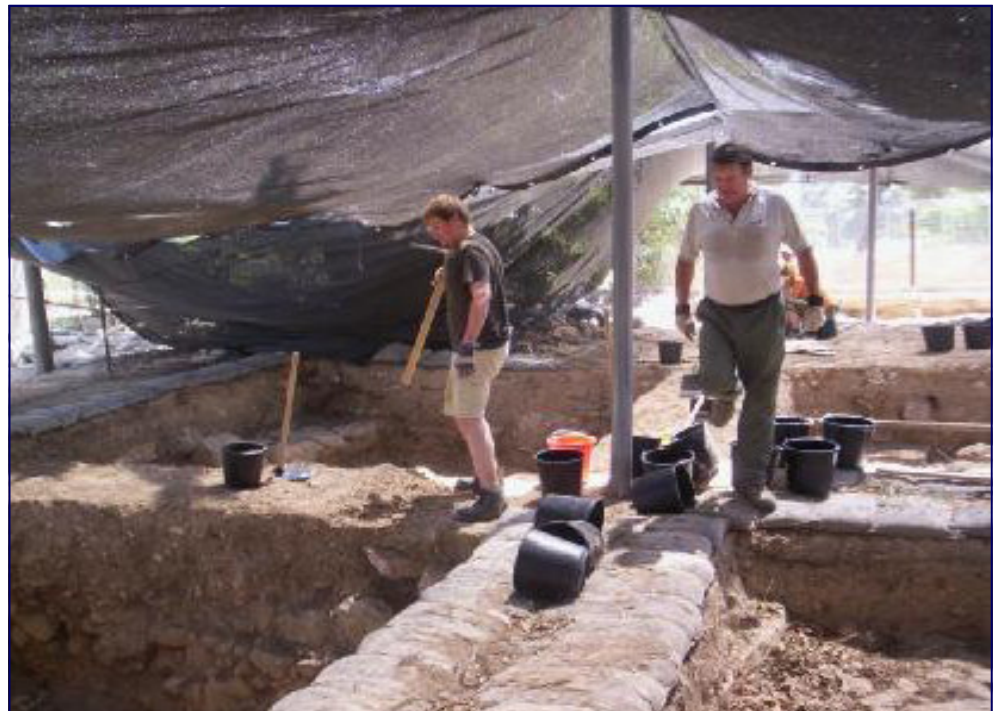
People working in the Ramat Rachel excavations