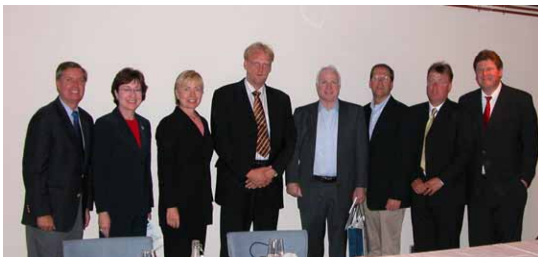
Figure 5. US Senators visiting INE regarding hydrogen

The ECTOS project has also been visited by number of dignitaries, among them a few presidents, ministers, senators, MP's, ambassadors and other VIPs.