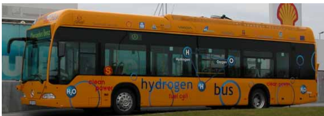
Figure 1. The fuel cell bus at the filling station

The hydrogen buses arrived in Iceland in September 2003. The location of Iceland now became a disadvantage as for the first time the vehicles had to be shipped on container vessels over the Atlantic. As the vehicles are delicate equipment the original idea was to ship the vehicles below deck, but due to the height of the vehicles they had to be shipped on deck. Fortunately the rough seas did not affect the equipment and they could be driven from the ship immediately after arrival. Another precaution taken into account in the original shipment was to send only two at once and one later to avoid if a drastic incident would happen, i.e. losing all of them at the same time if the ship sank on its voyage to Iceland.