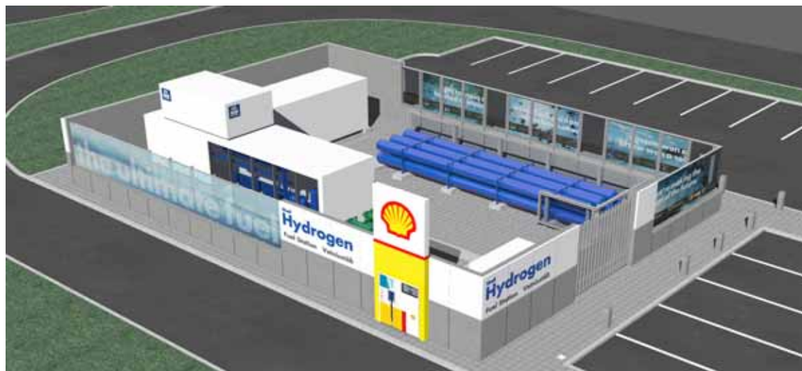
Figure 3 . Layout of the filling station in Iceland.

This development became very successful. During the preparatory stage the construction had to go through a neighbourhood introduction, where most neighbours were very positive towards having the hydrogen station located in the neighbourhood. The construction was completed during an 8 week period and the opening ceremony was held on April 24 th 2003 when a DC H 2 Sprinter was refuelled with hydrogen.