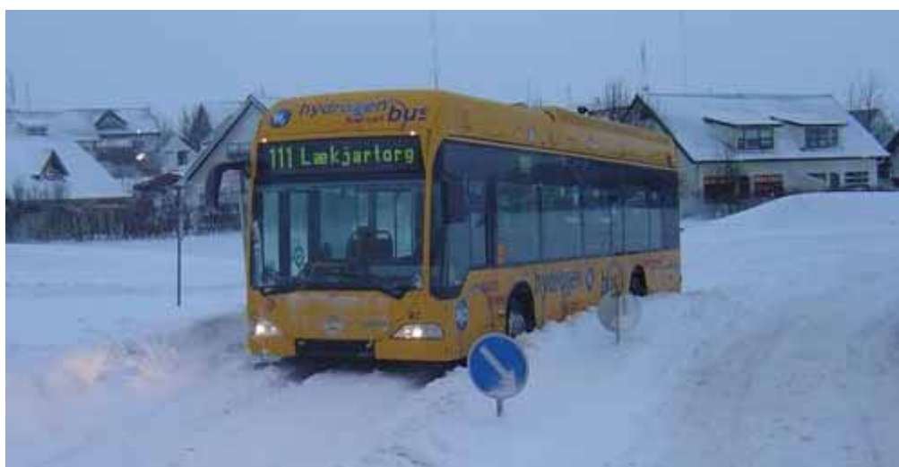
Figure 2. Iceland's harsh environment.

One of the original issues in Iceland is that the regular maintenance garage of the bus operator could not be used for the maintenance of the FC buses due to height constraints. Therefore the project group had to establish a specific and dedicated garage for the project. As is explained in the next chapter, the ECTOS project did not build a hydrogen filling station in a bus depot but decided to have a pre-commercial hydrogen refuelling station, located at a conventional gasoline station in Reykjavík. As a result the team focused on having the maintenance bay as close to the hydrogen dispensing facility as possible. Simultaneously it was decided to sub-contract the FC bus maintenance to Raesir (DC dealer at that time). This set up became very successful. Making the facility safe for the maintenance of the hydrogen buses was less costly than expected and the working conditions fulfilled all required standards. The maintenance facility has been working as planned and no safety or other issues have arisen with the facility. The technical set-up has been very good which created favourable working conditions. The cooperation between the maintenance team, the bus company, and also the technical team of DC, has been excellent which has resulted in the Iceland team having the fewest maintenance hours on the hydrogen buses compared with all the European cities in CUTE.