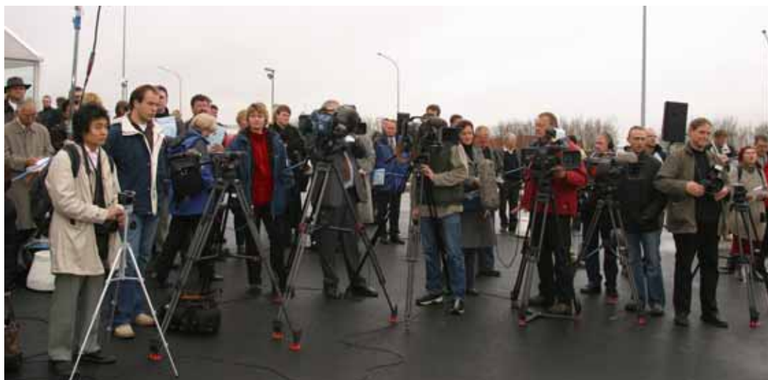
Figure 4. Media at the opening of the filling station April 24 th 2003

The ECTOS team was not prepared for what came. During the opening of the hydrogen refuelling station over 80 international media people showed up plus all the domestic media. This includes roughly 8-10 TV stations etc.