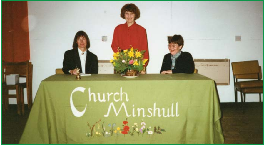
1996 - New W.I. Cloth designed and worked by members for our 50th Anniversary.