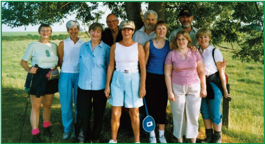
W.I. Members on a Country Walk