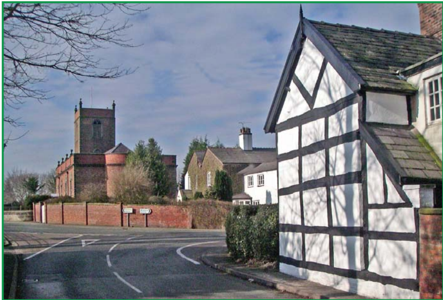
“Old House” Junction of B5074 and B5076 in Church Minshall