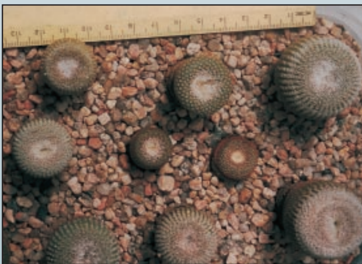
Figure 5 Some wild-collected specimens, in cultivation after 6 months. The smaller ones in the centre maintain their original appearance, but the others are growing faster and have become bloated as a result of extra nutrients and reduced sun radiation.

The very first fruit found was blown away by a gust of wind when one of us showed it to the others! Thereafter we worked lying down in order to diminish the effect of the wind on the working area. When the wind increased two people had to lie down very close to the plants in order to collect the seeds. Any inhabitants of the area who had the opportunity to observe us might have thought that we were in a very strange and suspicious position! On our first harvest day we stopped work just after noon because the wind made it impossible not only to collect seed but also to see what we were doing.