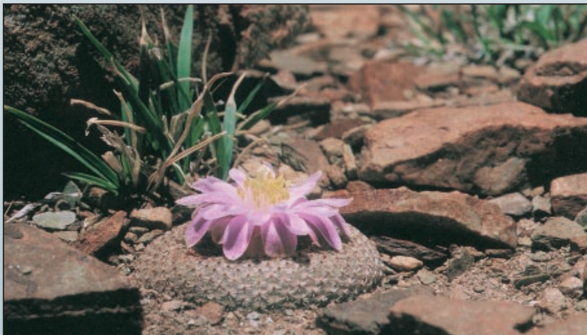
Figure 1 This is thought to be the first photograph ever taken of Yavia cryptocarpa flowering in the wild.

friends started to be concerned about the conservation of the species. The known area of habitat is relatively small and the plants are growing in a very special sort of soil. Although the species surely has a wider dist-