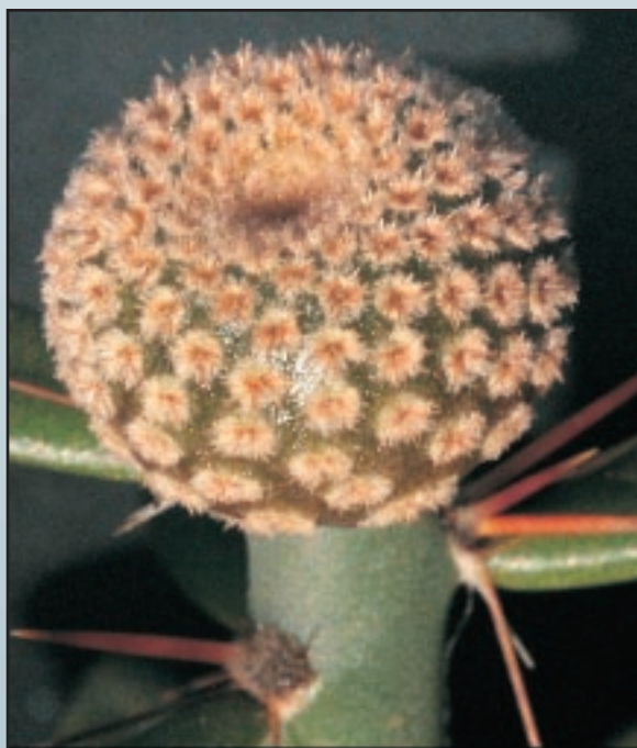
Figure 7 A seed-raised specimen, approximately one year old and 10mm diameter, grafted on Pereskia .

Roots are conical, succulent, and are a continuation of the underground stem. Often the underground stems and the roots are compressed by the stones (making them ideal specimens for herbaria!)