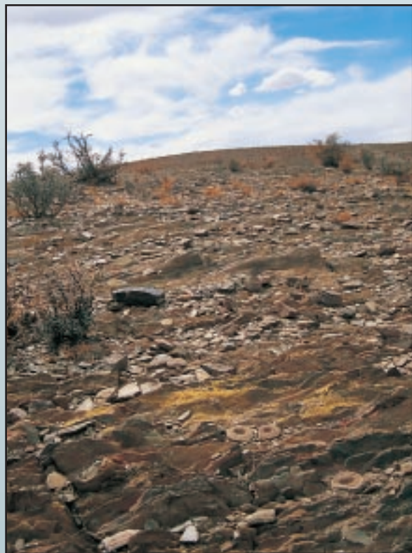
Figure 3 The habitat of Yavia cryptocarpa – note the sparse vegetation. Three specimens can be seen in the foreground.

We feel that the real danger to the species is over-collection by commercial or amateur collectors. Other recent new discoveries in Mexico ( Geohintonia mexicana and Aztekium hintonii ) resulted in very fast over-collection of habitat plants. We feel there is an immediate necessity to