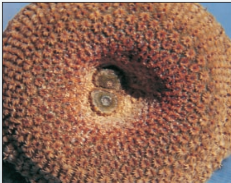
Figure 4 The top of a plant of Yavia cryptocarpa , with two fruits deep in the centre

also informed the provincial authorities of Jujuy Province. We also asked the former to keep the central authorities of CITES in Switzerland informed.