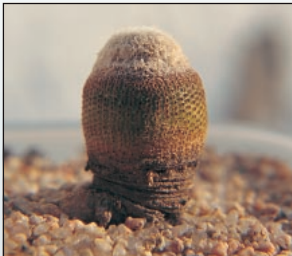
Figure 6 An extremely deformed specimen after 6 months in cultivation.

The stems are small; a specimen of 25mm diameter is an extraordinarily fat and old plant. They have a flat top, with a woolly depression in the centre. This superior disk is the only visible part of the plant and the only part receiving the