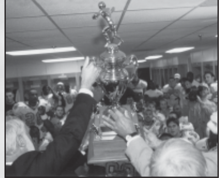
GOVERNOR'S CUP: Tech has defeated Georgia and claimed the rivalry trophy three of the last six years.

In 1993, NCAA mandated scholarship and total player limitations forced the discontinuation of the game and the Governor's Cup was retired. In 1994, a "Legends Game" was played between the two teams to keep the tradition alive, and