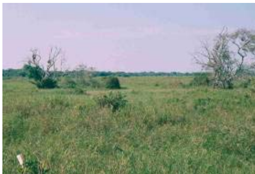
Above: Cienaga Sahaya

Corpocesar, Aguachica (Municipio Aguachica, Dpto. Cesar, c. 08°19'N; 73°38'W, 350 m, 10 - 11 & 15 January 2002). Corpocesar's southern headquarters are located on the outskirts of Aguachica, 3 km north of the town centre on the Magdalena Troncal. We studied a typically narrow belt of low secondary growth (canopy of 8 m; non-deforested area perhaps 60 m diameter at widest point) which followed a dry stream valley, c. 1 km east of Corpocesar's headquarters.