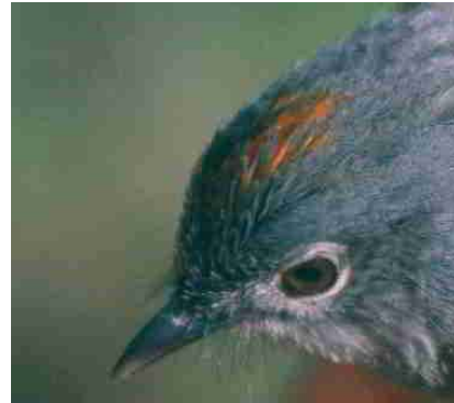
Left : typical Basileuterus cinereicollis . Right : individual showing reddish crown stripe and stronger eye ring.