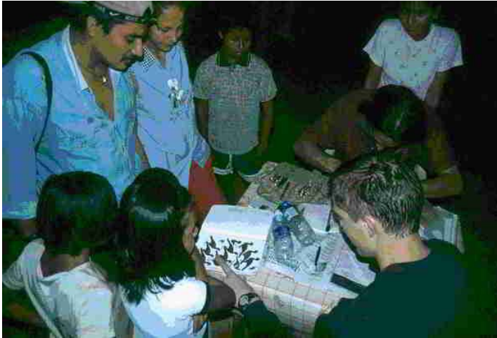
Above: Interviews with local people.

built up a conversation, building up interest and trust. Detailed notes were taken where good information was forthcoming from interviewees.