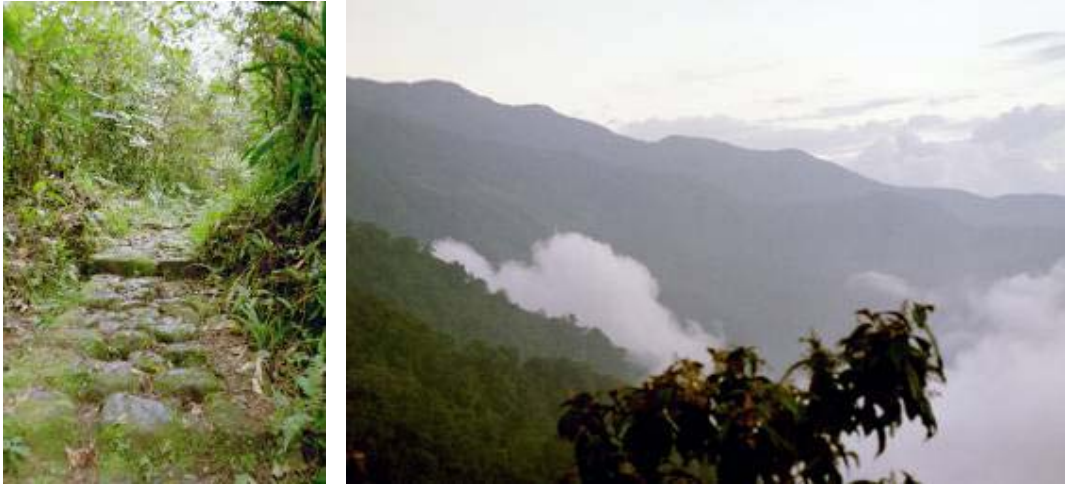
Above : The Camino de Lenguerke and Serranía de los Yariguíes.