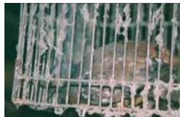
Below: C. soui in captivity, Río de Oro

not have been accessible at the time the bird was apparently caught (the early 1980s), without a c. 250 km river and road journey via Nechí.