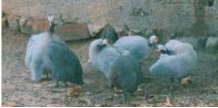
Left: Numida meleagris (a gallineta , but not a Tinamou)