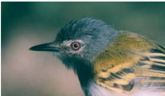
Above: Todirostrum sylvia

During observation periods, interesting details of selected species were noted such as: species, age, sex; number of individuals; other species present in association; habitat preferences and forest strata used. Additional notes were taken on rare or poorly known species, such as behaviour, vocalisations, foraging strategies and food. Record photographs were taken of important species encountered in the field.