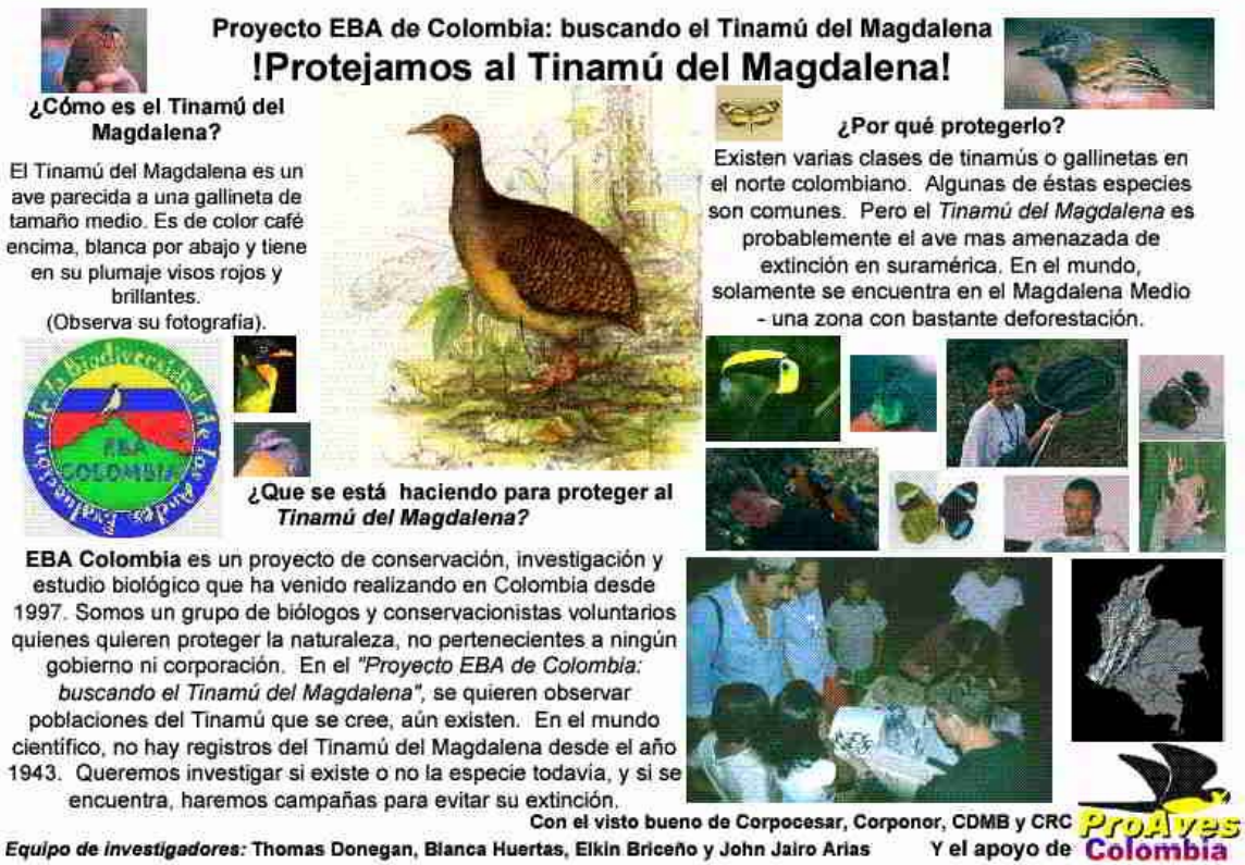
Below: Proyecto Tinamú poster.

Where responses were positive, we asked further questions about the species' habits and behaviour, such as when the interviewee had last seen the species and where, how rare it was, how it called and so on, such that we could locate potential sites for future fieldwork. Where we encountered people knowledgeable about birds and animals, we took additional notes on the presence of other rare species which are a frequent target of hunting, such as Crax Curassows and large mammal species.