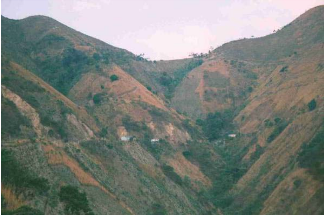
Above and right: typical deforested habitat in the foothills of the Cordillera Oriental near Aguachica, Cesar.