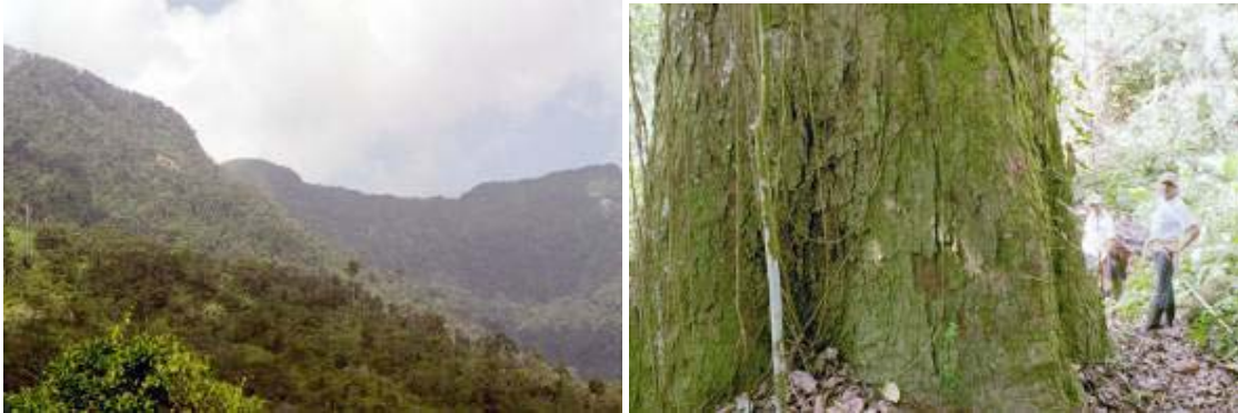
Above : Cerro de la Paz study site and an enormous tree typical of those found at this site.

Montebello, Cuchilla (Serranía) de la Paz (Above Montebello, Municipio Zapatoca, Dpto. Santander, 6°58'30"N; 73°25'40"W; 1000 m, 12 - 15 January 2003). Montebello is an historic estate established in the 1840s by German commercialist Geo von Lenguerke, whose business interests led to San Vicente de Chucurí first becoming an important economic region. We followed a trail ascending from Montebello (c. 800 m) into the Cuchilla de la Paz, and established a camp site on the eastern slope of the Cuchilla at 1000 m elevation, approximately half way between the settlements of Montebello and Matecacao. The site was dominated by lowland tree species, with many trees over 2.5 m diameter at breast height, and rising to over 25 - 30 m height. The understory was thicker than that at La Tapia, but still reasonably low and sparse. Huge lianas were also prevalent, with some over 0.5 m diameter. Again, our site was located on steep slopes within primary forest. Being good quality lowland forest in the Magdalena Valley, we considered this forest to be of extremely high conservation value, although deforestation pressure for fine woods and coca farming appear to be escalating alarmingly.