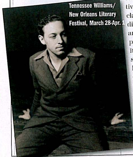
Tennessee Williams/ New Orleans Literary Festival, March 28-Apr. 1

Now in its 21st year, the Tennessee Williams/New Orleans Literary Festival