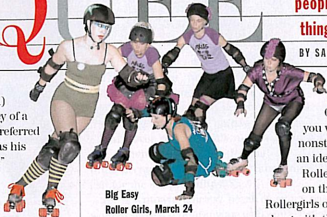
Big Easy Roller Girls, March 24

(March 28-Apr. 1) honors the legacy of a playwright who referred to New Orleans as his "spiritual home." The five-day festival offers classes, panel discussions and celebrity interviews to provoke thought and creativity. Theater events include a staged reading of John Kennedy Toole's A Confederacy of Dunces as well as several of Williams' lesser-known one-act plays. Food prepared by local chefs as well as literary and other French Quarter walking tours offer even more insight. The event