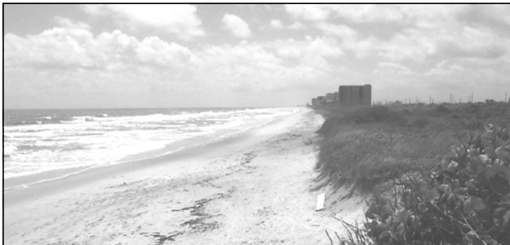
Seven-acre parcel south of Hightower Beach Park acquired with Florida Communities Trust Grant funds.

In Satellite Beach, Florida, we are proud to have "Beach" as our middle name!