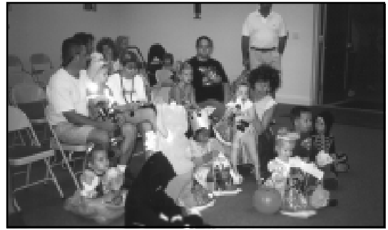
Lions Club Halloween Happening included food, fun, and costume awards. Thank you to Satellite Beach Lions Club for their continued community involvement.