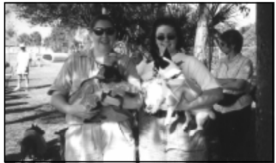
Howlin' at the Dog park during the October 27 Halloween event. Upcoming Event: Thanksgiving pet food drive to benefit the Brevard County Animal Shelter. Please bring donations to the Satellite Beach Dog Park.