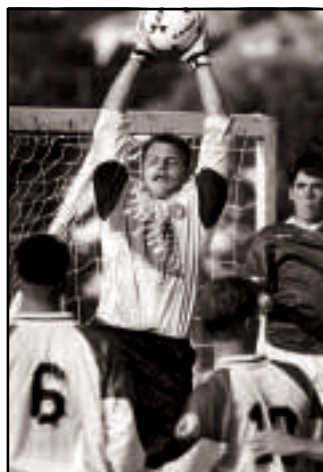
Marcus Hahnemann did not allow a goal in 10 straight games in 1991, and holds seven goalkeeping marks in all