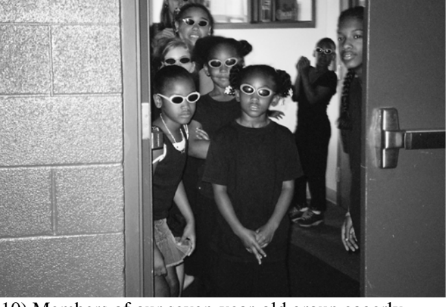
10) Members of our seven-year-old group eagerly await their turn to perform!