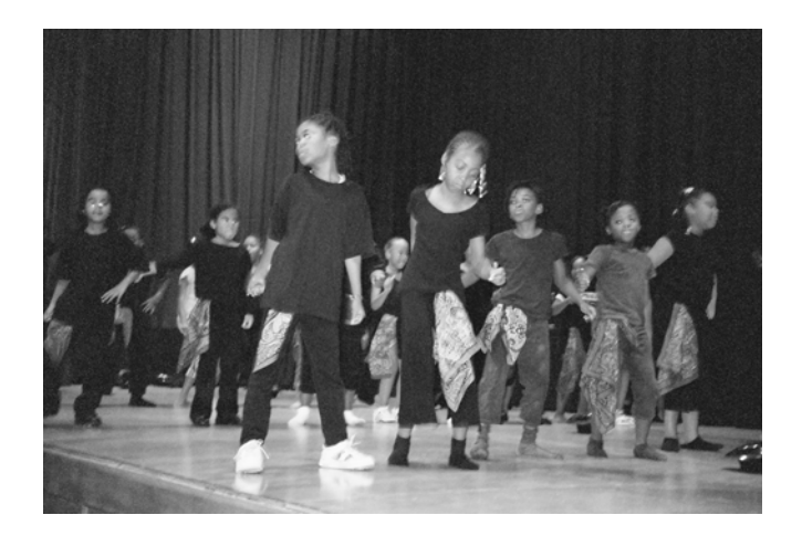
5) Members of our eight- & nine-year-old group perform a dance number.