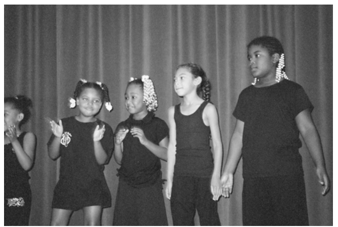
7) Members of the five & six-year-old group raise their voices in song.