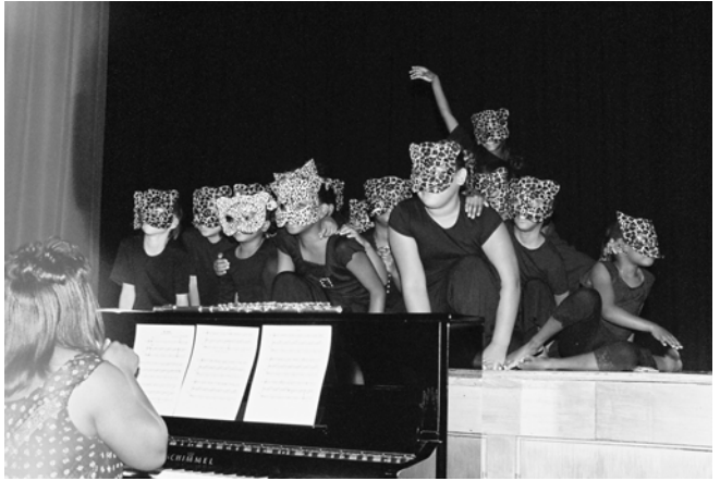
9) Our seven-year-old group dons cat costumes to perform a dance rendition of The Lion King .