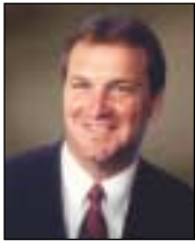
Gregory Kurtz Vice Mayor