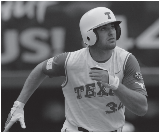
Chance Wheelless, Texas

* - Only honors since the Big 12 began play in 1997 are included.