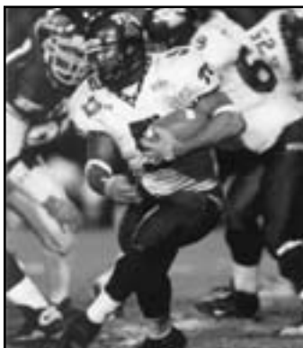
LaDainian Tomlinson 2000 - 4th