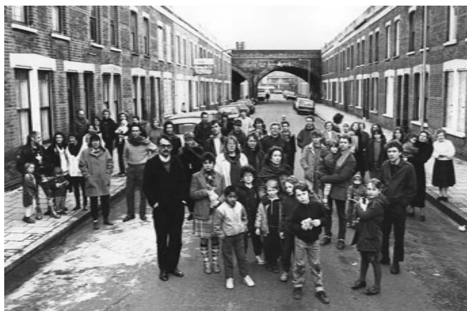
Beck Road, Hackney, 1988, Photo: Edward Woodman