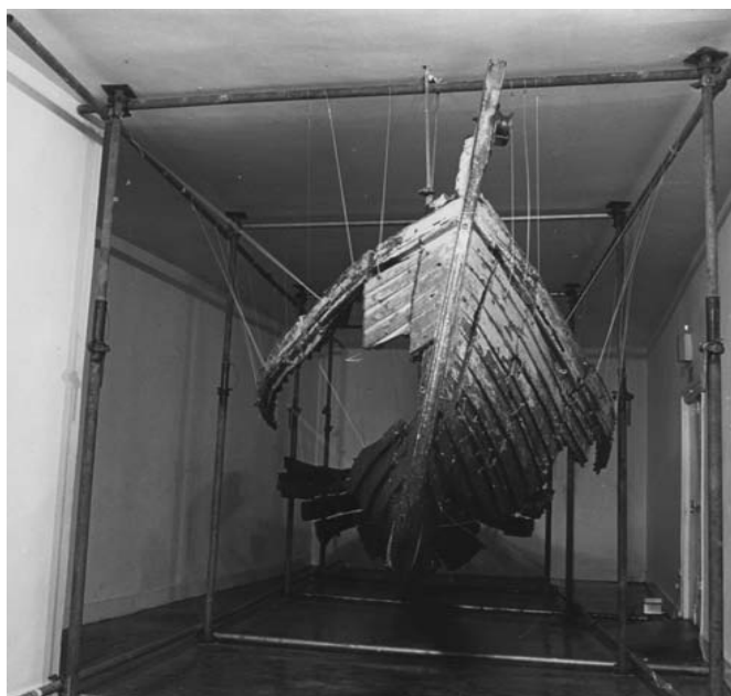
Working 12 Days at the Acme Gallery , Ron Haselden, The Acme Gallery, 1978

Obsolescence, overcrowding, insanitary conditions, lack of open spaces, inadequate road systems and bomb damage, require now, or within a short term of years, a high degree of reconstruction in conformity with modern accepted standards. Comprehensive re-planning schemes have become essential as a means of ensuring satisfactory living and working conditions, and economy in cost. 9