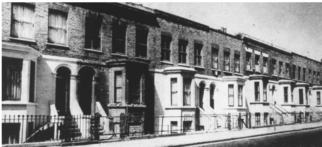
Grove Road, 1983