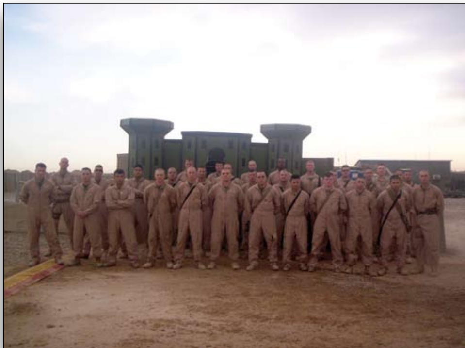
3rd Platoon, Charlie Company