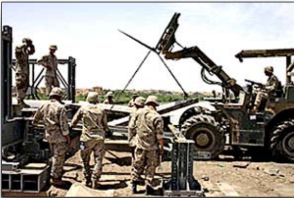
Building bridges may not have been what the soldiers of the U.S. Army's 216th Engineer Battalion expected to be doing in Iraq. But with the help of Marines from 6th Engineer Support Battalion, they participated in the $4 million Tikrit Bridge rebuilding project in Tikrit, Iraq during 2004.

June 2003-Present Elements and personnel deployed worldwide in support of Operation Enduring Freedom, Operation Iraqi Freedom, and Global War on Terrorism.