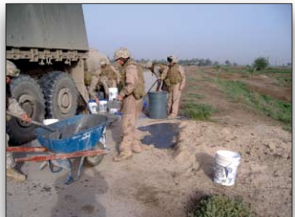
Marines from the 7th work on a road repair mission in Iraq