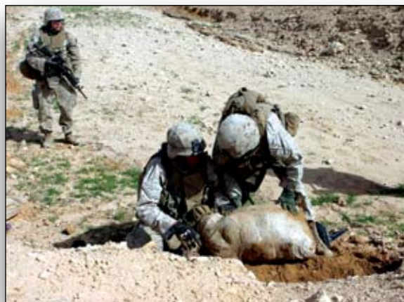
TOP: Two combat engineers from Charile Company, 1st Combat Engineer Battalion unearth explosives in Iraq, while another provides security. BOT-TOM: Two Marines from the 1st Engineers examine a busted radiator hose during work to construct a protective berm in Iraq.