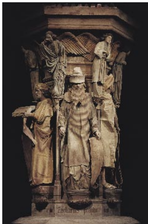
The Well of Moses is a fourteenth-century sculpture by Claus Sluter.

"I have visited art museums in many countries of the world searching for art that would fit the theme of the pageant and that would be feasible to recreate in life-size dimensions," he says. "It is difficult to find art—sculpture,