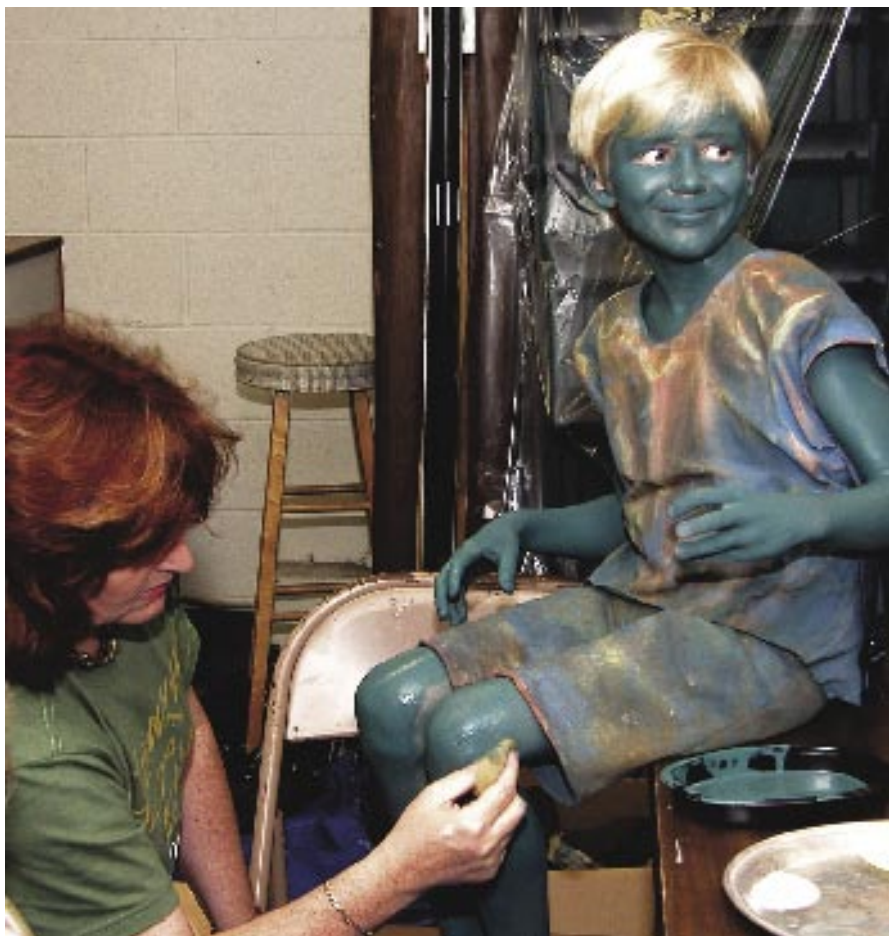
Body paint transforms a child into a sculpture.

equally between classical paintings and sculptures. One or two new pieces are created each year.