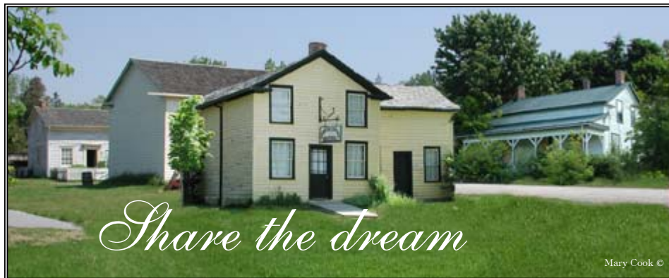
Mary Cook ©