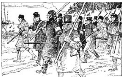
The March of the Rebels upon Toronto in December, 1857