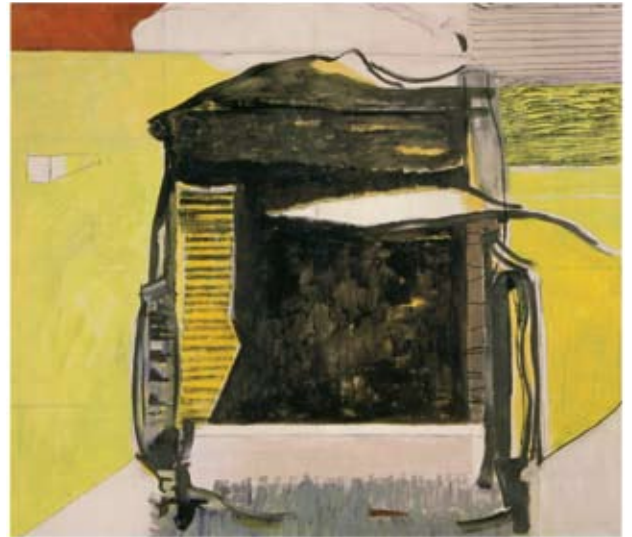
Form in a Landscape, Öl und Wachs auf Leinwand / Holz, 2002 - 2004, 92 x 107 cm