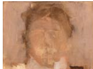
Portrait of an unknown man