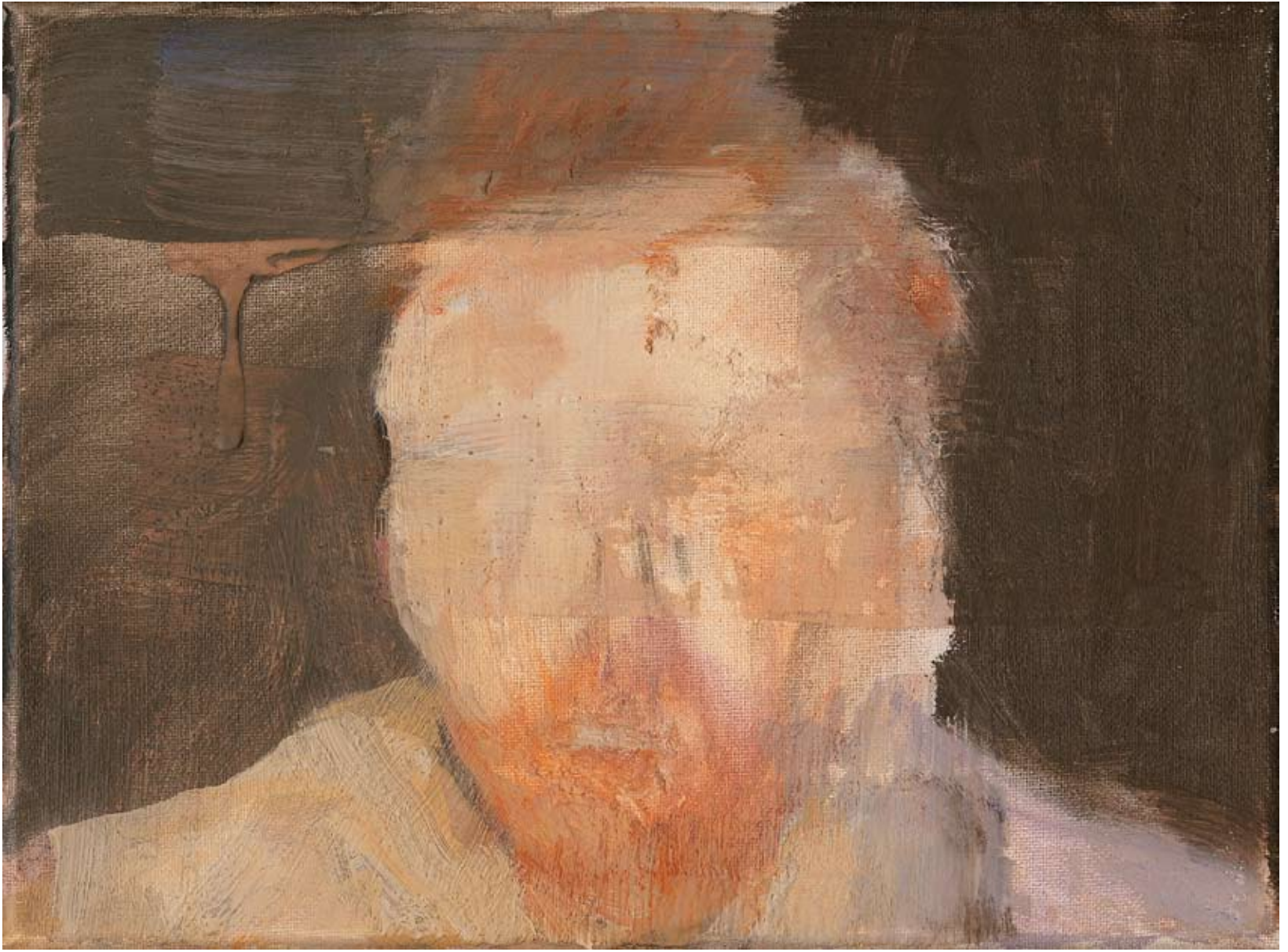
Vincent van Gogh