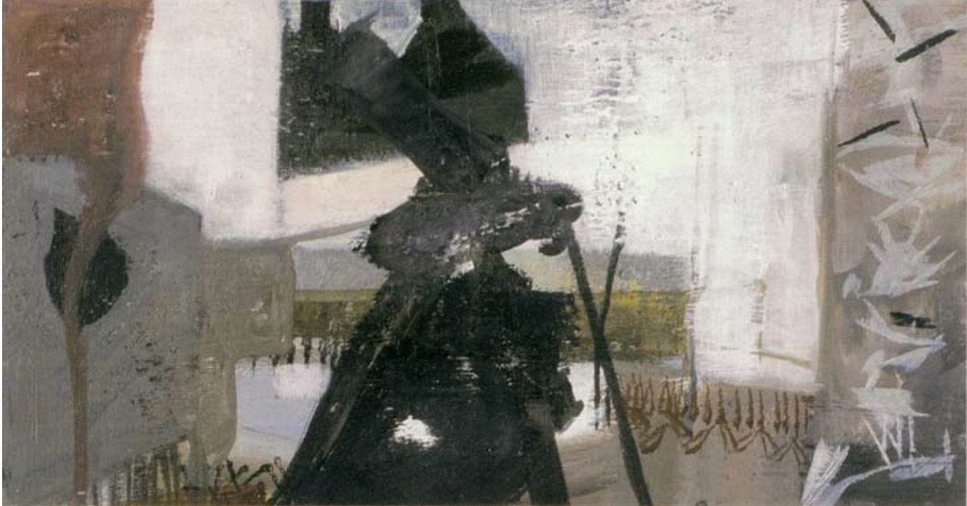
Warlord , 2002, Öl und Wachs auf Holz, 14,6 x 29,7 cm