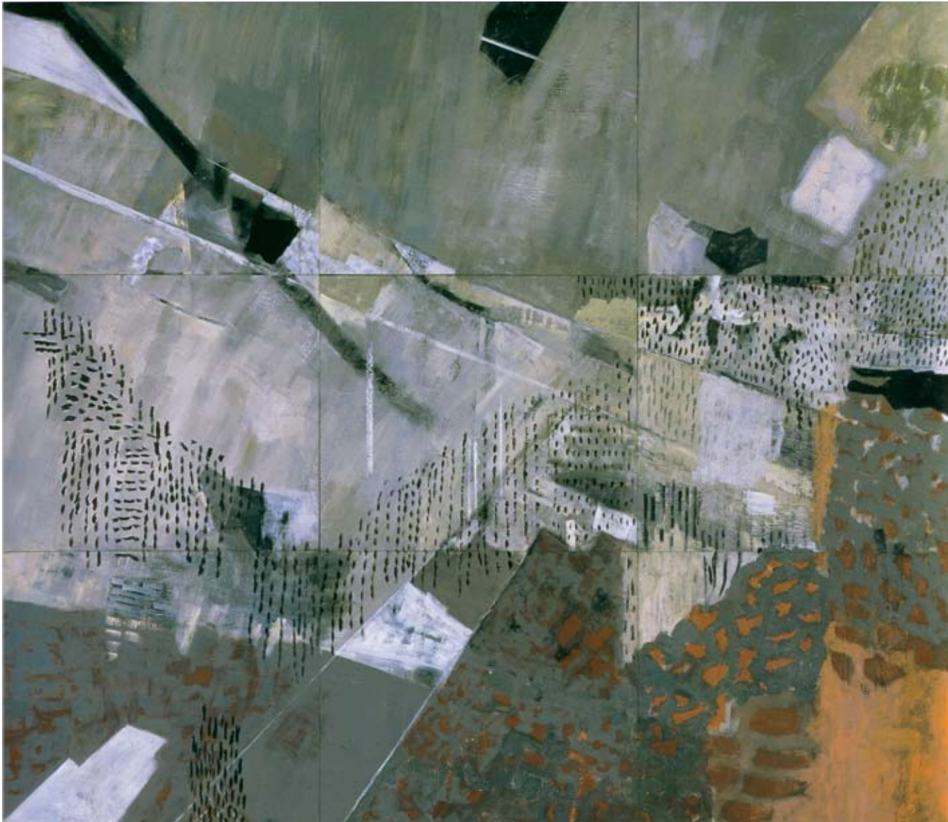
The Grass Harp , 2005, Öl und Wachs auf Holz, 276 x 321 cm