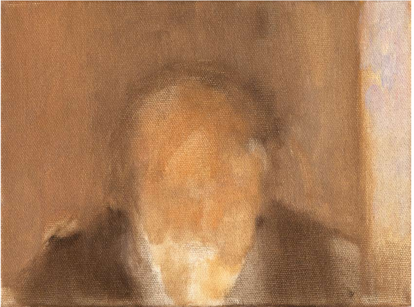
Alle Portraits: 2007, Öl auf Leinwand, 18 x 24 cm