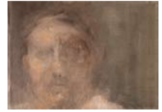
Ferdinand Sauerbruch after Max Liebermann