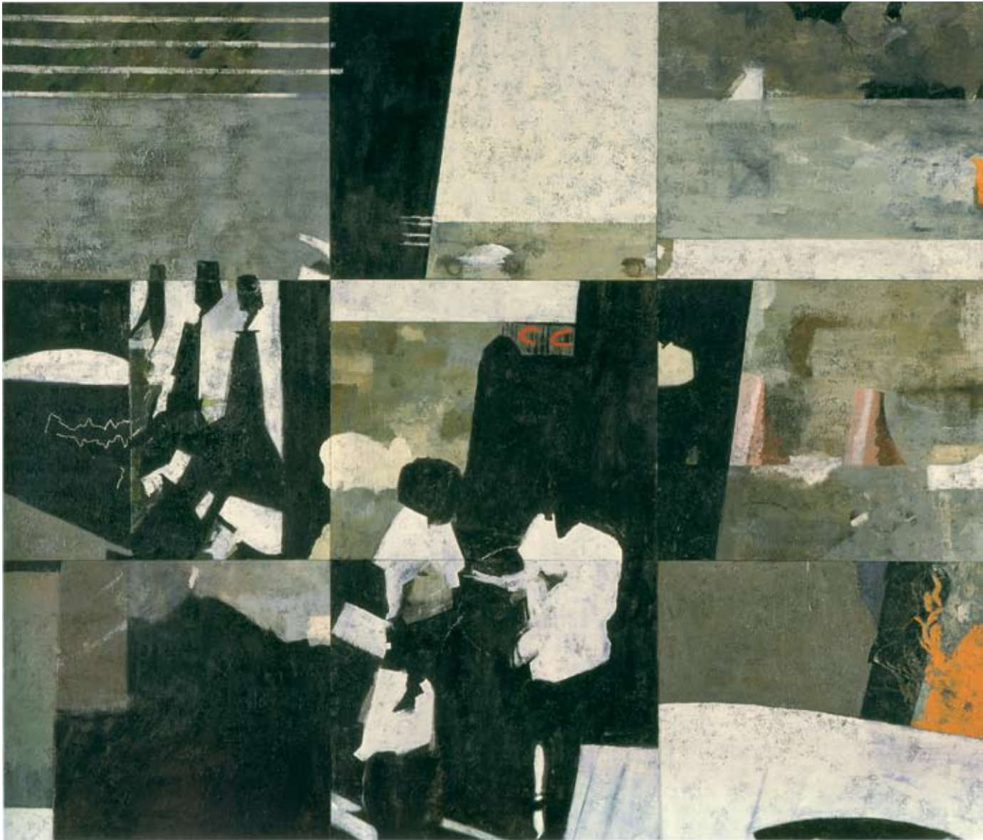
Conversation , 2004, Öl und Wachs auf Holz, 276 x 321 cm