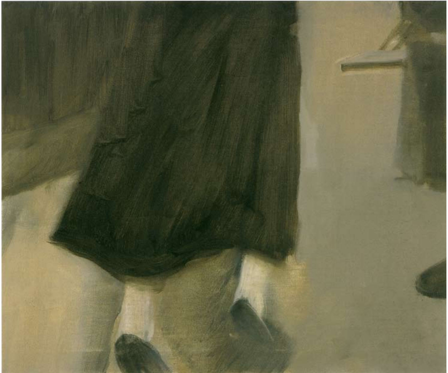
A Slight Ache 3, 2005, Öl und Wachs auf Leinwand, 50 x 60 cm