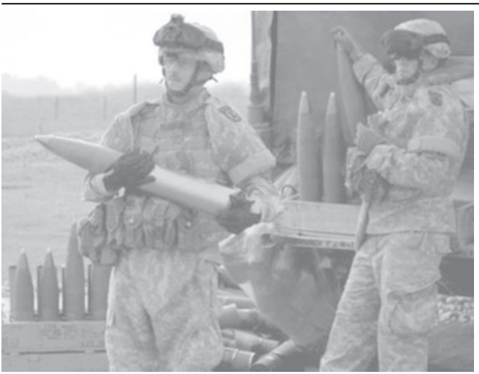
A US soldier carries a 105mm round to members of his firing team at their station at Camp Liberty, Iraq, on 28 Dec, 2005.