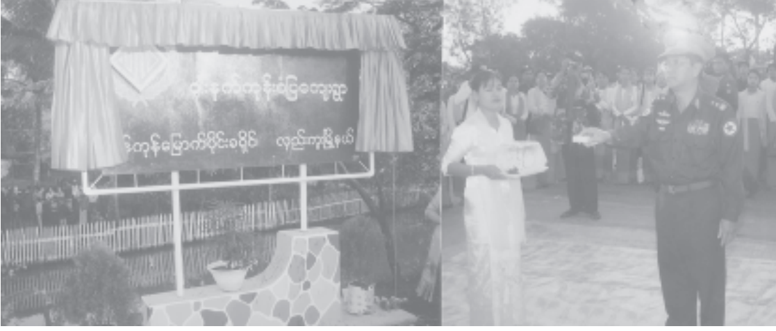
Commander Lt-Gen Myint Swe unveils the signboard of Wanetkon model village in Hlegu Township.

The commander and party then viewed round the village.