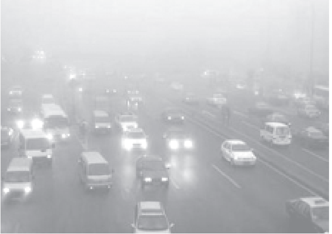
Vehicles move through thick fog on a road in Qingdao, eastern China's Shandong Province, on 30 Dec, 2005. Visibility had been reduced to as low as 30 meters (98 feet), local media reported.