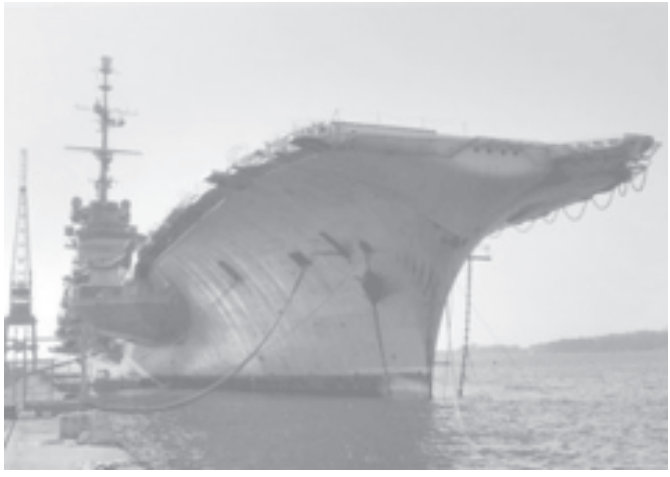
The former French aircraft carrier Clemenceau is docked at the Toulon military harbour, southern France, on 29 Dec, 2005.—Internet

African Americans. who do not produce as much of the vitamin because of their skin pigment, could also benefit significantly from a higher intake, the authors said. - MNA/Reuters