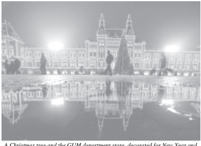
A Christmas tree and the GUM department store, decorated for New Year and Christmas celebrations, are reflected in melted snow on Red Square in Moscow, on 29 Dec, 2005.

"I am particularly heartened by the close synergy between the MDGs on the one hand, and China's Xiaokang vision of balanced development and putting people first on the other. the secretary-general