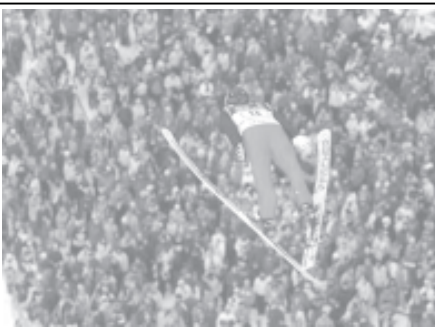
Ski jumper Okabe Takanobu soars above spectators during the Four Hills ski jumping tournament in Oberstdorf, southern Germany, on 29 Dec, 2005. Takanobu took the fourth place with 130.5 meters.