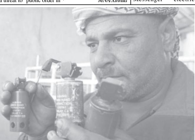
An Iraqi resident holds empty smoke grenade canisters he said US soldiers used when they raided and searched his house for guerillas south of Baghdad, on 29 Dec, 2005.

On the eve, 4,500 police to follow travelling of the capital" from people around the capital, hit last month by an urban violence leaving nearly 10,000 cars torched. A state of emergency imposed in response to the rioting, allowing local governors to declare curfews and giving wider powers to the police, remains in place until February. Some 330 cars were torched across France last 31 December.