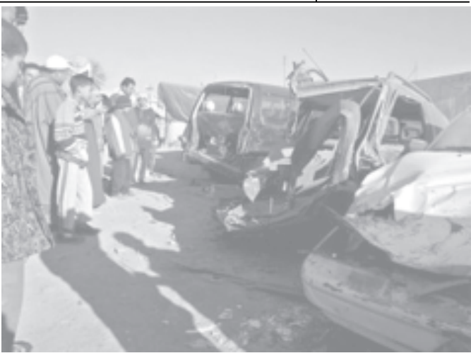
People crowd around a row of destroyed cars, according to residents the result of a battle tank driving through a narrow street during a pre-dawn raid by the US military, in a neigborhood in Baghdad, Iraq, on 29 Dec, 2005.

"All five service members were evacuated from the scene to Kandahar for treatment. At the Kandahar Airfield Hospital the one service member was pronounced dead, one is being further evacuated for continued treatment and the remaining three were treated and released," it added. The cause of the accident is under investigation, and the name of the deceased is being withheld pending notification of next of kin. - MNA/Xinhua