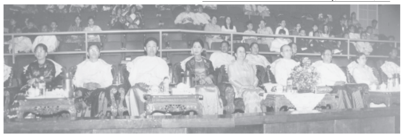
Secretary-1 Lt-Gen Thein Sein and wife Daw Khin Khin Win seen at Motion Picture Academy awards presentation ceremony for 2004 (News on page 1).