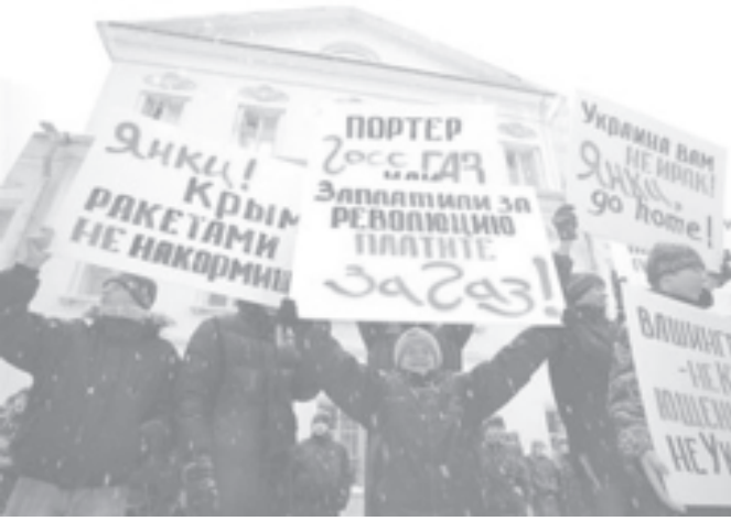
Demonstrators picket the American Embassy in Moscow, on 29 Dec, 2005. The posters assail the United States for its alleged support for Ukraine in its gas price dispute with Russia. —Internet