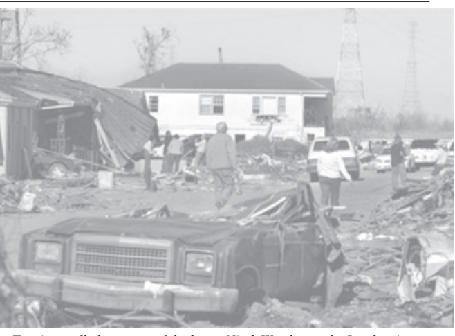
Tourists walk the streets of the lower Ninth Ward near the London Avenue canal breach, on 29 Dec, 2005 in New Orleans. Hurricane Katrina caused the canals to breach, flooding the city.—Internet

the rest from public coffers.— MNA/Reuters