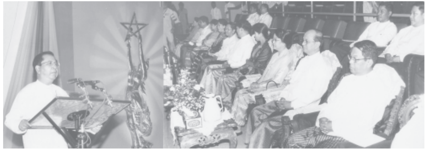
Secretary-1 Lt-Gen Thein Sein attends the Motion Picture Academy Awards Presentation Ceremony, and Minister Brig-Gen Kyaw Hsan gives an address.