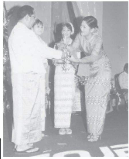
Information Minister Brig-Gen Kyaw Hsan presents the best supporting actress award to Soe Myat Nanda.