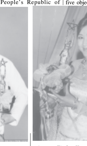
Actress Eindra Kyaw Zin.

Now it is heartening to see that Myanmar film world has made a significant progress due to the coordinated efforts of executives of the Asiayon. I have often briefed on the five objectives that those