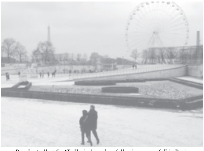
People stroll at the 'Tuilleries' gardens following a snowfall in Paris, on 28 Dec, 2005. —Internet

According to the new offset trade principle, the new offset agreement will prioritize projects designed to boost the development of the Hungarian defence industry, the Economics and Transport Ministry noted in a document released on Wednesday. MNA/Xinhua