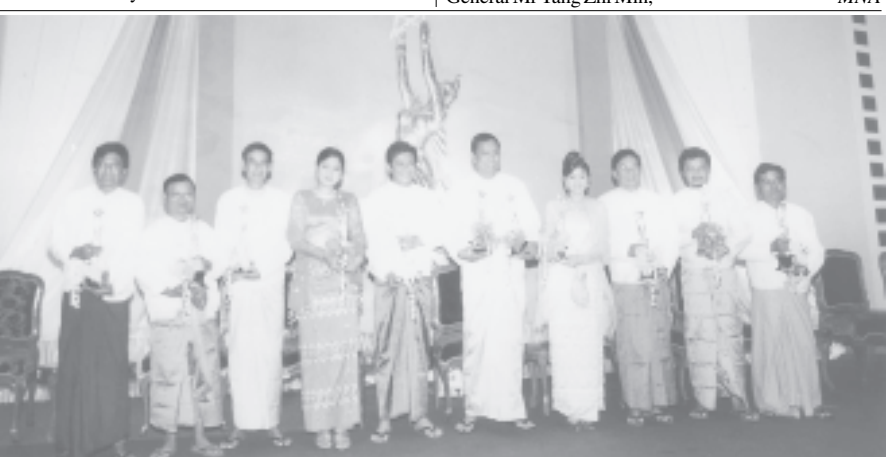
Academy awards winners for 2004.