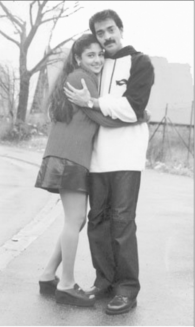
Tamil love: though living in Germany, this couple do not forget their culture in 'Love Channel'

The producer, director, hero and heroine are not very popular with the public. The movie is expected to succeed based on the strength in its story and screenplay.