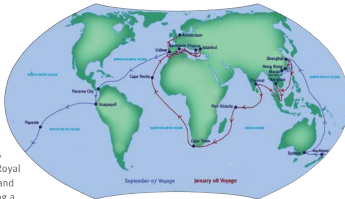
Itineraries subject to change