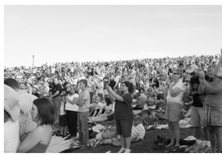
A record crowd attended the sold-out Sawyer Brown concert on June 2.