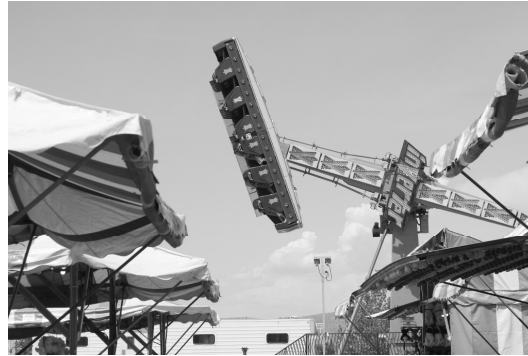
The carnival kicked things up a notch with a rock climbing wall, a new ride called the Inverter, and an old favorite—the fun slide.