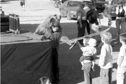
Leonardo the Lion, mascot of the Real Salt Lake soccer team, signs autographs for his young fans at the B5 concert June 1.