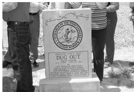
Eagle Mountain paid tribute to its rich history by dedicating a monument to the original Pony Express Trail (now part of Pony Express Parkway).

What a wonderful time! Thank you so much! Bring us out again! The boys loved it!