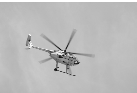
Also new this year—helicopter rides were a popular choice, taking off from The Ranches Academy.