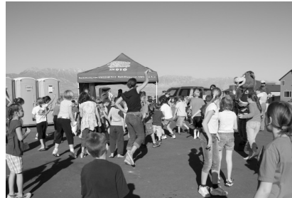
The Radio Disney AM910 block party got everyone moving and ready for the B5 concert. Grizzbee, the Salt Lake Grizzlies mascot, joined in the dancing and prize giveaways.