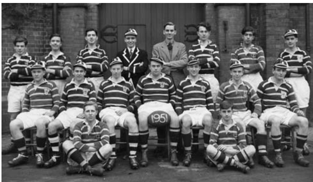
1 st XV Rugby 1951