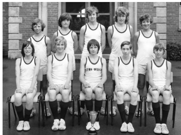
1975 Athletics Team (Ref: # 1757)