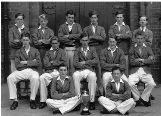
Meynell house Cricket Team 1946