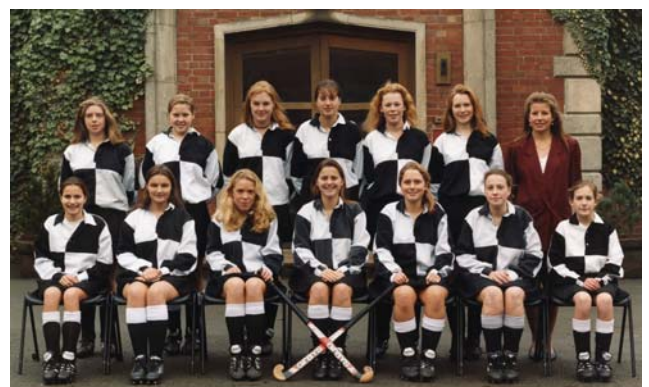
1st XI Girls Hockey.1996