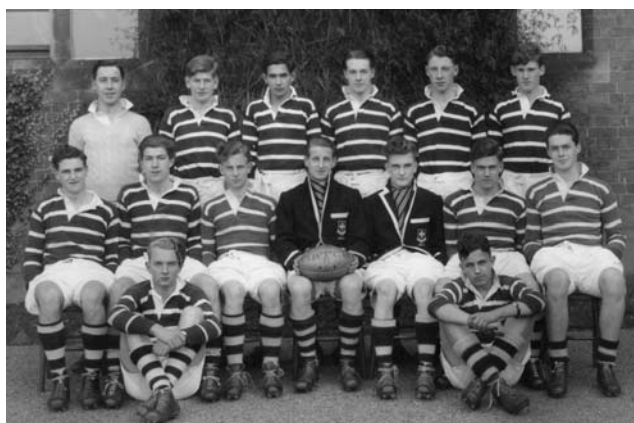
1 st XV Rugby (Photo Ref: # 1078)