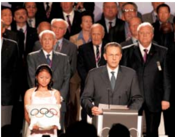
Jacques Rogge preparing to announce the 2012 Games host, after opening the envelope handed by Singapore sailor Griselda Khng (left). After the announcement of IOC, Londoners cheered as the city of London won the vote to host the next Olympic in 2012.

“One Voice, One Rhythm, One World” musical extravaganza at the Esplanade – Theatres on the Bay was watched by an audience that included Singapore's Prime Minister Lee Hsien Loong,