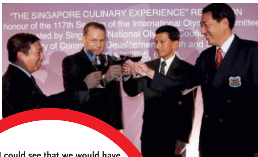
(From left) Ng Ser Miang, Jacques Rogge, Singapore Ministers Vivian Balakrishnan and Teo Chee Hean share a toast to the success of the 117th IOC Session.

"I could see that we would have tremendous logistical support in Singapore and we'd also have the advantage of it being a very natural meeting place for Chinese culture, Indian culture and Western culture."