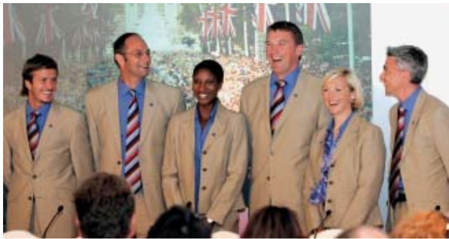
(From left) British footballer David Beckham, Olympic rowing champion Steve Redgrave, heptathlon Olympian Denise Lewis, Olympic and world champion rower Matthew Pinsent, double Olympic gold medalist Shirley Robertson and Jonathan Edwards, also an Olympic gold medalist, at the London IOC delegation press conference at Carlton Hotel.

It was a rare opportunity for Singapore to showcase itself as an ideal city for international sports meetings and sporting events, as well as a unique tourist destination. The Session also gave a boost to the sports industry in Singapore.