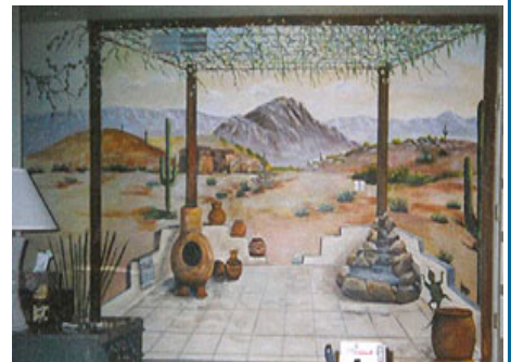
. . . then, sip margaritas while enjoying the view from the “patio.”