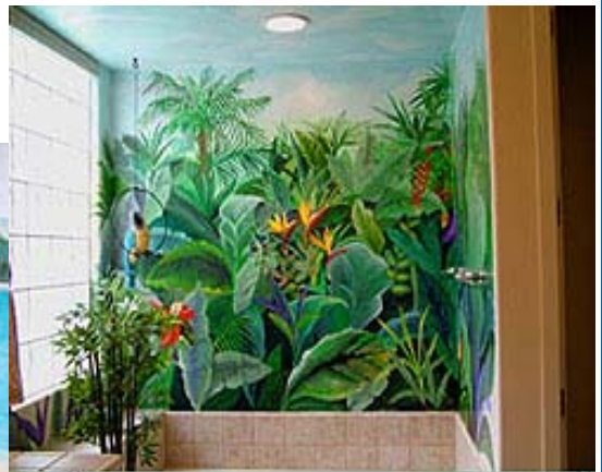
Wake up each morning on a Hawaiian beach, or relax after a long day bathing in a tropical rain forest.