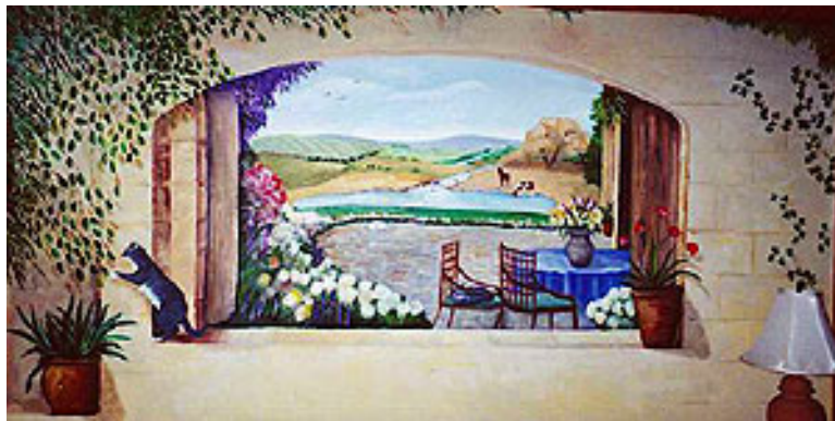
Don't have the right yard to create your Feng Shui? Paint it!

Whether you are just starting out in your first home or finally moved into the home you will retire in, you will want to make sure it continues to be there for your loved ones. Mortgage Protection and peace of mind are only a phone call away.