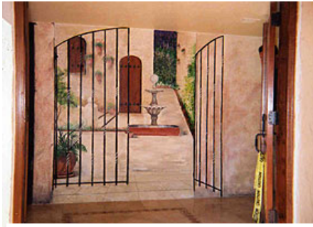
Welcome your guests into your home with a glimpse of the “courtyard,”

Bright warm colors, a welcoming mural, even a butler can greet your guests.