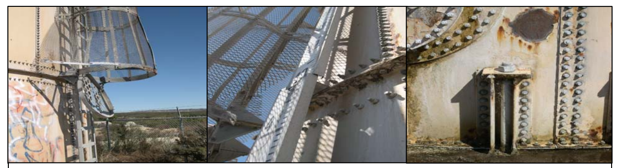
Campo Band of the Kumeyaay Nation, California; Left: The ladder gate is hanging by the chain. It is not otherwise attached. Right: The liquid level indicator is broken here. A few feet above, the indicator has completely broken off, and was found lying in pieces on the ground.