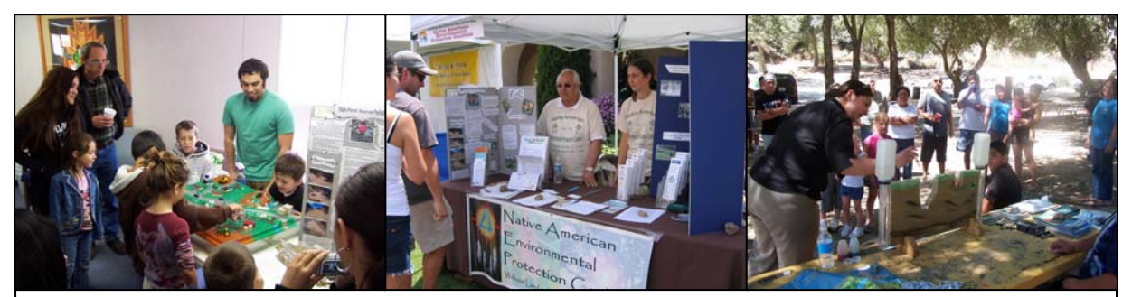
La Jolla Band of Luiseno Indians, California, left: La Jolla Earth Day; center: La Jolla/NAEPC booth at Balboa Earth Day; right: World Monitoring Day at La Jolla.

For many Tribes, holding Earth Day events has been going on for many years. For the last seven years the Pechanga Band of Luiseno Indians has funded its annual Tribal Earth Day event. During the event, tribal members participate in a reservation wide clean up, environmental educational booths are provided by state, county, city and other local environmental resources and everyone participates in learning activities.