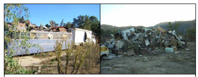
Pala Band of Mission Indians, Pala, California: Before removal

The Pala Tribe removed 204 tons of metal and debris as part of their Reservation wide cleanup program. Citing of landfills is common near tribal lands. Pala has been able to litigate, with some success, against this proposed Gregory Canyon landfill project that would endanger their ground water and drinking water supply, protected sensitive habitats, as well as a Luiseño sacred site. Most recently the tribe has successfully capped their old community landfill and has been increasing their enforcement of illegal dumping that has been occurring on the tribal lands as well as funding the construction of a new transfer