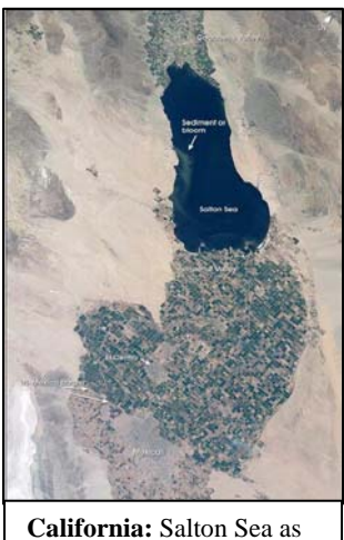
California: Salton Sea as seen from the space shuttle.

Without the opportunity to acquire air funding and build the capacity to efficiently deal with these revisions Tribes may be unable to provide comment. No comment is usually taken to mean not concerned or uninterested, which is untrue. The U.S. Border Tribes are encumbered by the additional issues of their location to Mexico and lack of border funds.