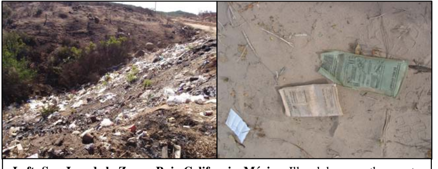
Left: San Jose de la Zorra, Baja California, México: Illegal dump on the way to the community. Right: Cocopah Indian Tribe, Arizona: Army MRE trash.

Baja California Indigenous communities have no solid waste collection. All trash is burned or buried in shallow pits, including plastics, household hazardous waste and recyclable material. The communities have conducted large scale community clean ups, but there is no place to