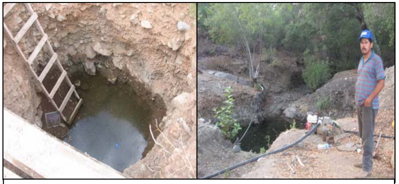
San Jose de la Zorra, left: a hand-dug drinking water well; right: Agricultural well, with make shift pump, occasionally used for drinking

The Cocopah Indian Tribe and Cucapá indigenous communities are negatively impacted by the decreased flows and water quality into the Lower Colorado River delta region. In San Antonio Necua, uncontrolled sand mining and water extraction for the growing city of Ensenada are depleting the quality and quantity of drinking water in this small community.