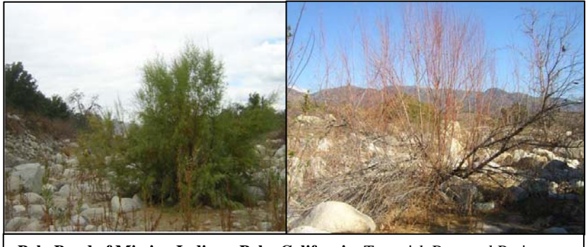
Pala Band of Mission Indians, Pala, California: Tamarisk Removal Project. Left: Before; Right: After. Dead biomass will be left in place for now.

Tribes are implementing many other water quality improvements projects, including the removal of invasive species to restore riparian areas. Invasive species, such as tamarisk, can drink as must as 10 times the amount of water as native plants, increase the salinity of the soil, and inhibit the growth of native species. The Los Coyotes Band of Indians (Los Coyotes), Pechanga, Pala, and La Jolla are all working on wetland restoration and invasive species removal in their wetlands and streams, restoring the natural habitats and improving their water sources. As part of its nonpoint source pollution control program, the La Jolla has started a wetlands restoration project which seeks to reduce sediment and nutrient loading in the San Luis Rey River, as well as provide habitat for amphibians and birds. Los Coyotes has also recently received funding to implement a wetlands identification project in order to assess, map and preserve wetlands on their reservation. Restored wetlands intercept runoff and transform and store excessive pollutant loads like nutrients, sediment, and heavy metals.