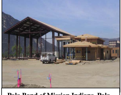
Pala Band of Mission Indians, Pala, California: Construction of the new Pala Fire Station.

The Pala Band of Mission Indians is currently building a state of the art fire station with Tribal funding which will provide a much needed benefit to Pala and surrounding communities within the San Luis Rey River valley. The Pala Fire