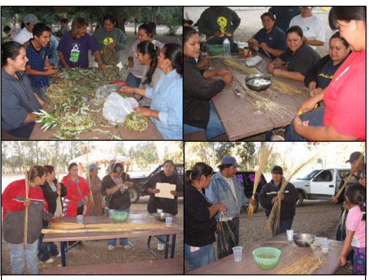
Baja California, Mexico: Workshops in the indigenous communities funded by SEMARNAT.

Indigenous communities in Baja California have embarked upon their eco-tourism ventures for tourists in order to assist them in preserving the environmental integrity of the community and surrounding area while capitalizing on their cultural assets and preserving this knowledge. These eco-tours teach environmental stewardship and preserve environmental and cultural values while creating jobs for the community. A sustainable economy that incorporates these values can lead to fewer environmental and health problems for the entire community.