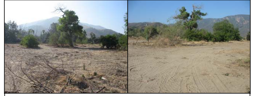
Pala Band of Mission Indians, Pala, CA: After removal: included 662 tires, 2 semi trailers, 4 buses, 3 trucks, 2 vans, 35 appliances, 25 tons of metal, 107 tons of trash and 6 trailers.

station utilizing an existing building which will be retrofitted to accommodate the transfer station. Construction is scheduled to begin in June 2007.