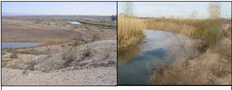
Quechan Indian Tribe, Arizona: Left; Quechan East Wetlands Project. Cocopah Indian Tribe, Arizona: Right; Lower Colorado River Limitrophe

For many centuries, the Cocopah, known as the River People, lived in harmony with the mighty Lower Colorado River Delta region, one of the largest tidal wetlands in the world. Today, the river is among North America's top ten most endangered rivers, and the Cocopah Indian