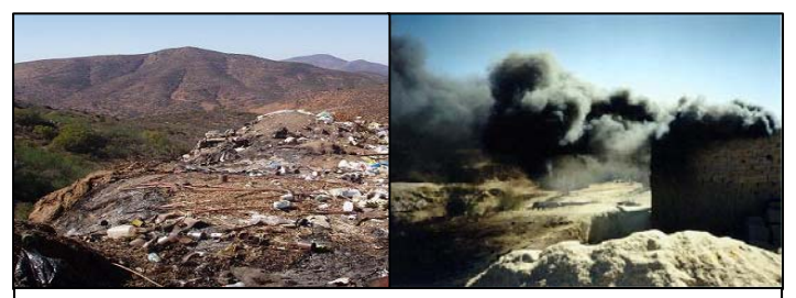
San Jose de la Zorra, Mexico, left: Burnt trash outside the community; right, brick kilns in Mexico.

Tilling practices and pesticide use are a heavy impact on rural farming areas. Urban areas are minimally impacted, but as Tribes and Indigenous communities are located in rural areas, they