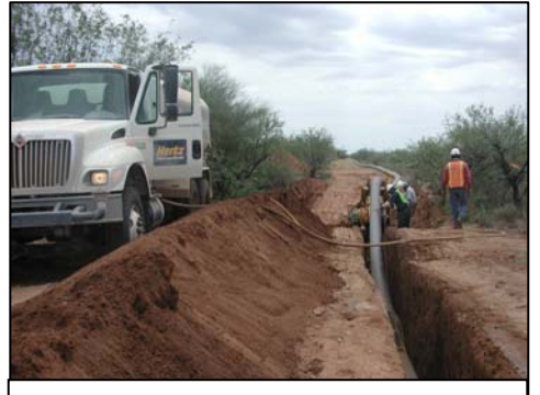
Tohono O'odham Nation, Arizona: The Tribes Baboquivari Intertie Project, 15 miles long, connects four communities

An area that all Tribes are struggling to cover financially