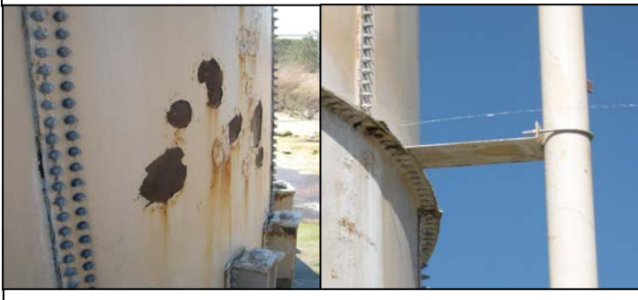
Campo Band of the Kumeyaay Nation, California, left; Example of the corrosion evident in many places on the tank's exterior. Right: Example of a leak in the tank

Tribes that have public water systems and tanks for water storage are dealing with is damage from vandalism, aging tanks, poor construction, and high construction costs that undermines their infrastructure capacity. In California, the costs of labor to put in a water system are prohibitive and sometime's poor construction and materials are used. The Campo Band of the Kumeyaay Nation has had