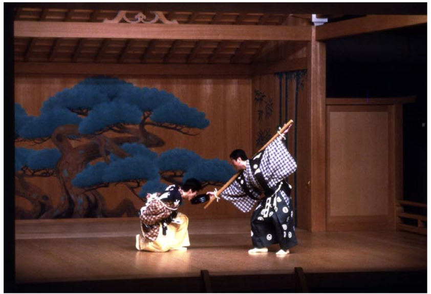
Kyogen performance Scene from an Izumi school performance of the play Boshihari ( Fit to be Tied).

As the play opens, a court official ( wakizure role) explains that Lady Aoi, the pregnant wife of court noble Genji, is ill, and the sorceress Teruhi has been called in an attempt to identify the spirit possessing her. A folded robe placed at the front of the stage represents Lady Aoi.